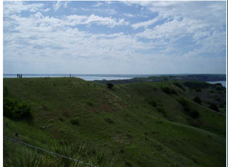
The Narrows of the Missouri River on the Lower Brule Sioux Tribal lands.