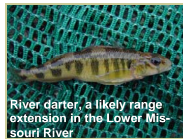
River darter, a likely range extension in the Lower Missouri River

Missouri River than St. Charles Co. (just west of St. Louis, MO). This makes the range extension approximately 100 miles west of its last known collection.