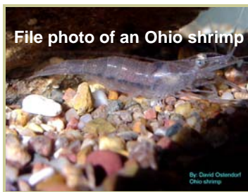
File photo of an Ohio shrimp

While sampling a Missouri River site near Jefferson City, MO, an MDC electrofishing crew collected a river darter, Percina shumardi . This fish was sampled at approximately river mile 121.