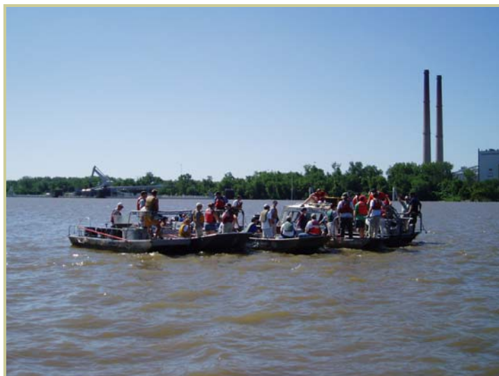
A flotilla of training on the Mississippi River near Alton, IL. This area is upstream of lock and dam No. 26 which is the last lock and dam on the upper Mississippi River.

researchers reviewing their EMAP-GRE skills on the Mississippi River near Alton, IL. Emphasis was on Quality Assurance — since a number of crews are collecting data over a very large geographic area, it is important that data be collected with uniform standards across all crews and sites. Consistent sampling procedures will insure that the data will be comparable when conclusions are drawn on the condition of our Central U.S. Great River ecosystems.