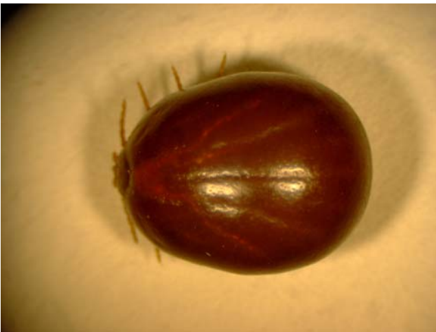
Aponomma latum Dorsal View

The remarks on the report stated, “This is the most common tick parasite of large snakes in most of sub-Saharan Africa and in the pet trade worldwide. It frequently arrives in the USA on imported pet pythons especially from West African countries.”