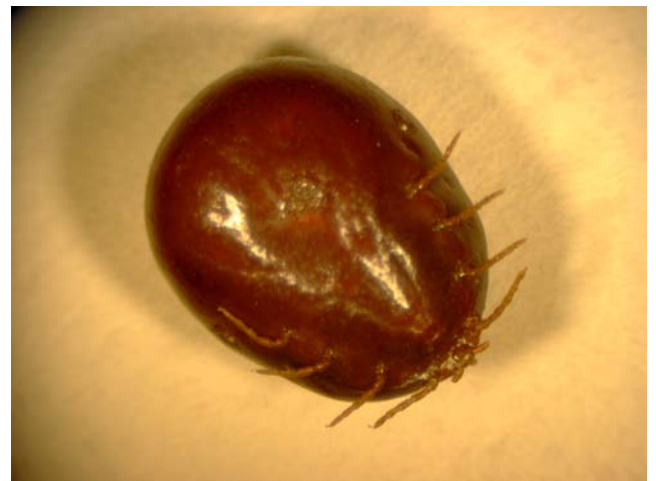
Aponomma latum Ventral View

This tick was collected from a Ball Python at Sheridan Animal Hospital on January 7, 2003. It could not be identified using the current reference keys. It was sent to the USDA, National Veterinary Science Laboratory and identified as a Snake Tick.