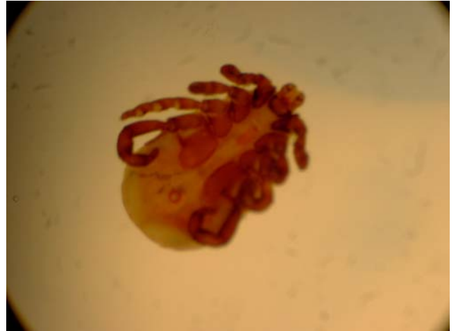
Dermacentor albipictis Ventral View

This tick was sent by Arnot Odgen Medical Center. It was collected from an adult male on November 5, 2002. It was attached to his left hip. The victim was deer hunting in Schuyler County and observed other ticks on a deer. The