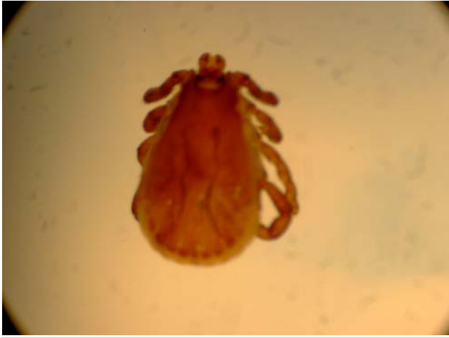
Dermacentor albipictis Dorsal View

tick was an intact unengorged adult male. This species of tick is known to reach the adult stage during the winter months.