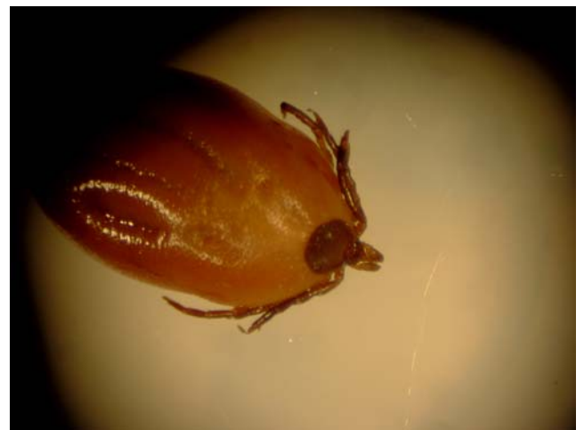
Ixodes Scapularis , the Blacklegged Tick or Deer Tick - Dorsal View

Our primary target species for Tick Identification is Ixodes scapularis , the vector of Lyme disease. Over the past 4 years, 22.8% of all ticks identified have been Ixodes scapularis . The yearly breakdown is 14.8% in 2004, 39.8% in 2003, 15.5% in 2002, and 18.4% in 2001. The increased percentage of specimens identified as Ixodes scapularis in 2003 may be indicative of one or both of the following factors: a greater population of the species in the area or a greater awareness of tick-borne diseases. This cannot be statistically proven due to the small sample size.