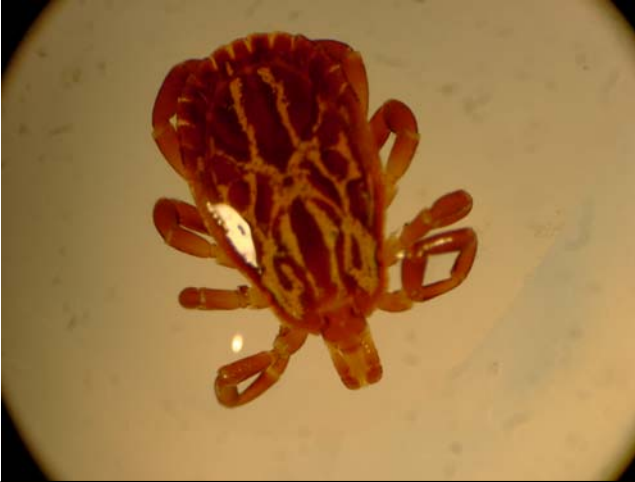
Amblyomma maculatum Dorsal View

Amblyomma maculatum , the Gulf Coast Tick.