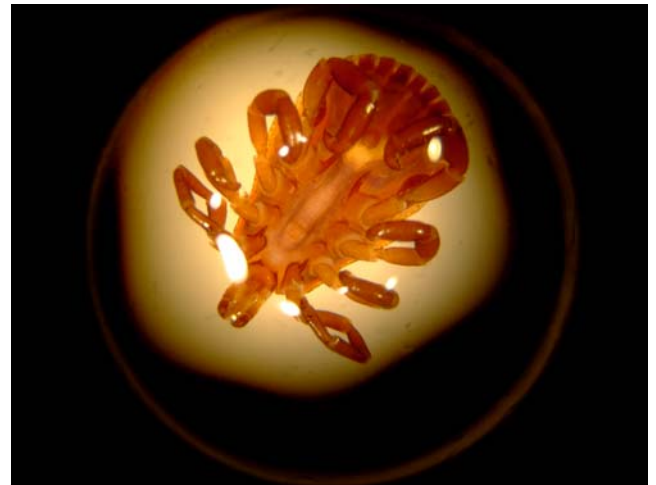
Amblyomma maculatum Ventral View

This event was the first recorded occurrence of the Gulf Coast Tick in Erie County. It was sent for identification by the victims father and was collected on December 12, 2002. The victim was an