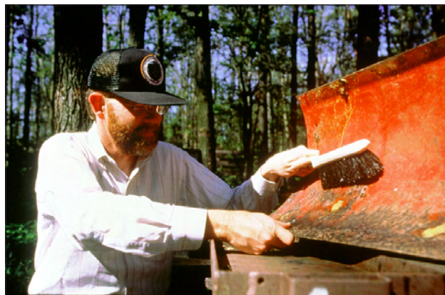
Figure 11 —Make sure to turn over farm implements and other equipment that can conceal egg masses from view and provide protection against predators and harsh winter weather.

Remember, you are the key to preventing the interstate movement of gypsy moths on outdoor household articles, including recreational vehicles. Do your part to prevent the spread of this pest.