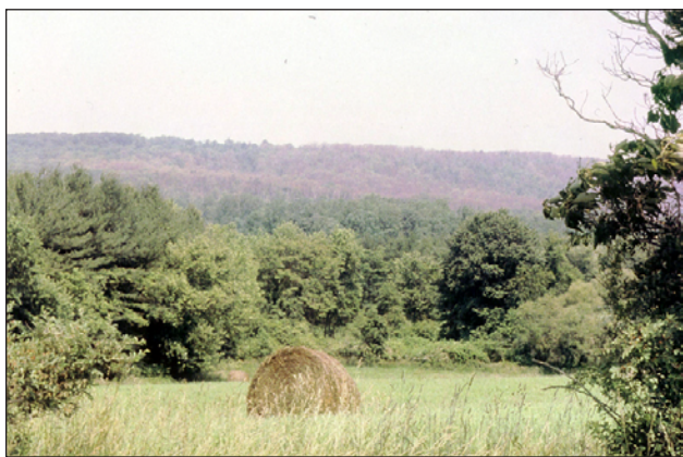
Figure 2 —At first glance, this appears to be a beautiful forest, but nearly half the trees in the background have been defoliated by the gypsy moth. Defoliation alters habitat, adversely affecting canopy and understory ecosystems.

If you live where the gypsy moth is prevalent, you know the damage the larval stage of this insect can cause. Those leaf-eating caterpillars devour the leaves of many hardwood trees and shrubs, giving summer scenes a barren, wintry look. Gypsy moth larvae have been known to defoliate up to 13 million acres of trees in 1 season,