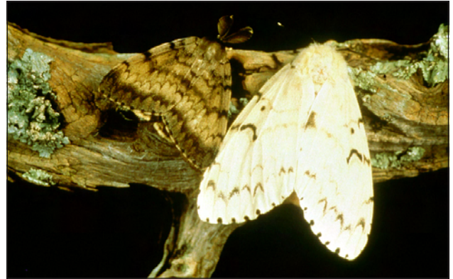
Figure 9 —The adult female gypsy moth is about twice the size of the male and white in color.

Neither sex feeds in the moth stage; adults mate and lay eggs only. The eggs are the dormant stage of the life cycle, allowing the pest to survive winter weather. In the spring the eggs hatch, starting the life cycle over again.