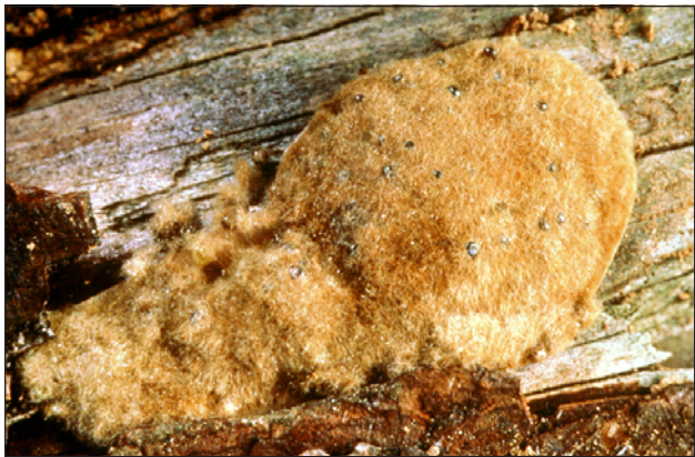
Figure 5 —The gypsy moth egg mass is covered with buff or yellowish “hairs,” giving it a velvety appearance.

If you choose to inspect your outdoor household articles, you need to be able to identify gypsy moth life stages. Most important is the egg mass. This publication contains photographs to help you.