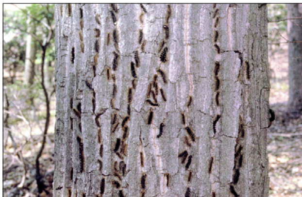
Figure 7 —Gypsy moth caterpillars survive in high numbers in North America because here, unlike Europe, they don't have many natural enemies.

In southernmost infested States, eggs begin hatching in late March. Hatching starts around early May in the northernmost infested States. The grayish, hairy caterpillars are tiny at first but easy to identify when about half-grown because they have pairs of red and blue dots on their back. Mature caterpillars are from 1.5 to 2.5 inches long. These caterpillars are voracious feeders and, in outbreak situations, can devour all the leaves from the trees and plants in entire neighborhoods and forests.