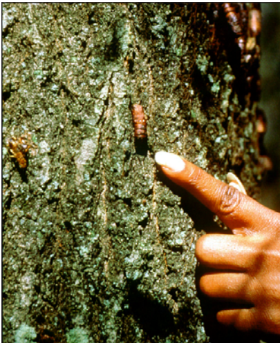
Figure 8 —Adult gypsy moths emerge in the summer from dark-brown pupal cases that can remain on trees and other surfaces after the moths are gone.

Caterpillars stop feeding when they enter the pupal or “cocoon” stage, ranging from May in southernmost infested States to early July in northernmost infested States, varying with weather and climate. Adult moths emerge from the dark-brown pupal cases 10 to 14 days later. Males have light tan to brown wings marked with dark, wavy bands, and a 1.5-inch wingspread. Female moths are larger than males and generally white, with a wingspread of about 2.5 inches. Despite having larger wings, the female moths cannot fly.