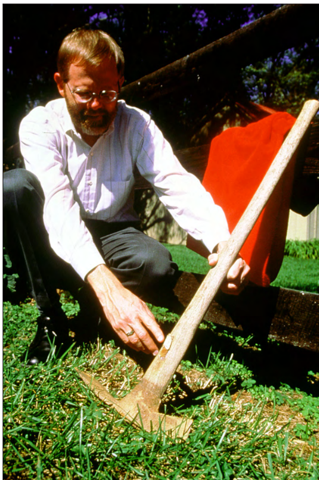
Figure 10 —Yard tools left outside during the spring and summer months are a favorite spot for female gypsy moths to deposit egg masses.

An effective way to dispose of gypsy moth life stages is to remove them by hand. Scrape egg masses from their locations with a putty knife, stiff brush, or similar handtool. Dispose of egg masses and other life stages in a container of hot, soapy water, or place them in a plastic bag, seal it, and set it in the sun. You may elect to abandon articles if they are heavily infested and of little value to you.