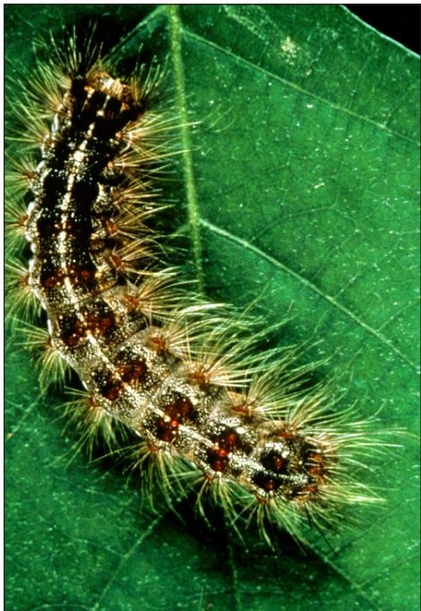
Figure 6 —Identifying gypsy moth larvae is easy because they have several pairs of blue and red dots on their back.

The gypsy moth goes through four stages of development—egg, larva (caterpillar), pupa (cocoon), and adult (moth). It has one generation a year. During the summer months, female moths attach egg masses to trees, stones, walls, logs, and other outdoor objects, including outdoor household articles. Each egg mass contains up to 1,000 eggs and is covered with buff or yellowish “hairs” from the abdomen of the female. The velvety egg masses vary in size but on average are usually about an inch and a half long and three-quarters of an inch wide (a little bigger than a quarter).