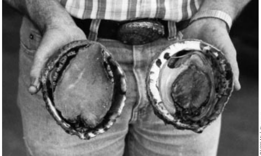
Withering Syndrome in black abalone is apparent when comparing the foot of a healthy animal (left) with an ill one.

However, a field study found no correlation between the