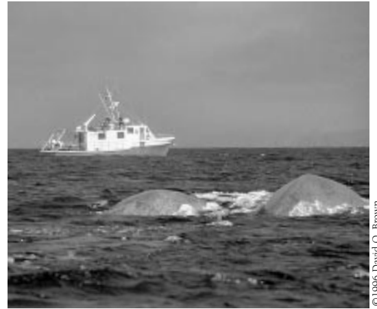
Two blue whales cruise past the RV Ballena during the massive research effort known as WHAPS96.

Once a whale was tagged, the Ballena followed it and acoustically tracked krill distribu-