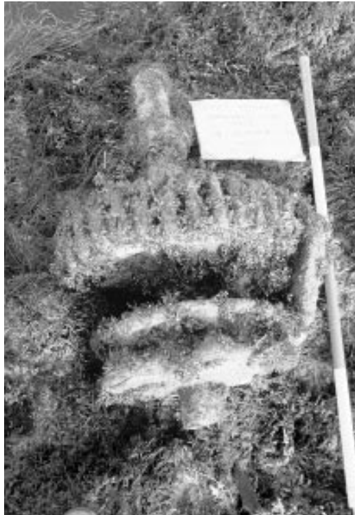
Some island shipwrecks scatter their parts on land, like this piece of windlass from the J.M. Colman site on San Miguel.

Wrecks represent tragedies and loss to their owners. Harrowing tales of survival