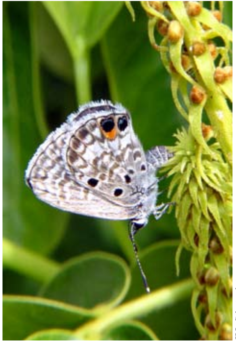
Miami blue butterfly, a species that is a candidate for listing as endangered.

Because of the number of candidates and the time required to list a species, we developed a priority system designed to direct our efforts toward the plants and animals in the greatest need. In our priority system,