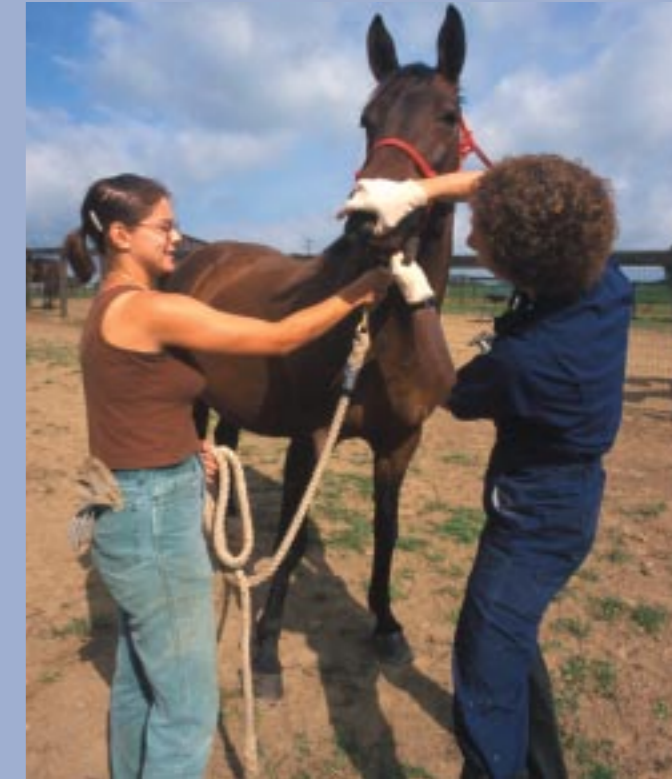
Wilson scholarship students do hands-on, paid work for APHIS during summer and holiday periods and have the opportunity for full-time employment after receiving their terminal degree.