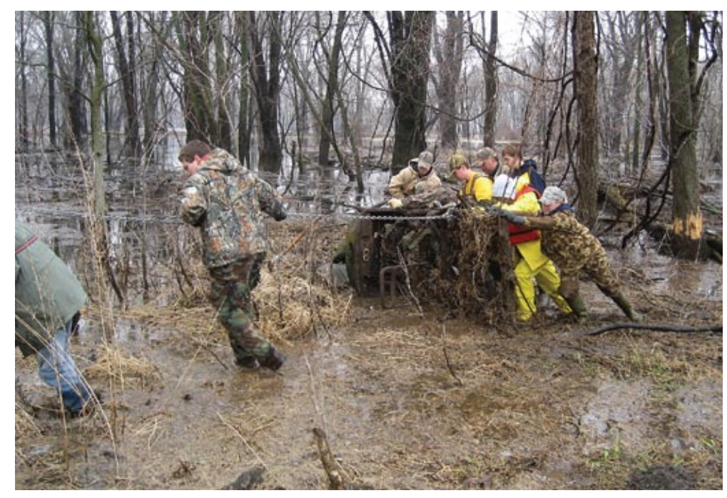
Friends of Pool 9 (Upper Mississippi Refuge) pull an antique auto chassis out of the Mississippi River near Lansing Iowa during a 2008 river cleanup.

One key issue was the condition of sand beaches along the Mississippi. With the support of the Service, the U.S. Army Corps of Engineers, Iowa and Wisconsin Department of Natural Resources, 14 beaches have been restored and 27 beach pockets were created for camping. "We have developed a level of trust, respect and friendship unparalleled