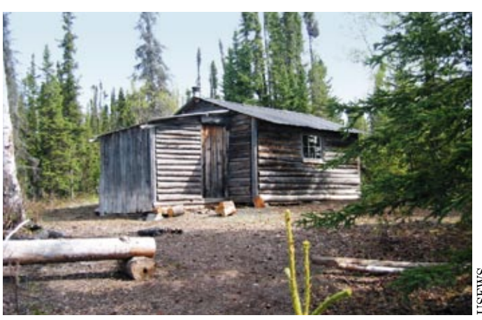
Educational interpretive panels for display at 10 restored cabins on Kenai National Wildlife Refuge in Alaska are among the projects that received Preserve America grants from the National Fish and Wildlife Foundation.

• The Friends of the Rydell Refuge, where 2,100 acres were once occupied by pioneering homesteaders, will