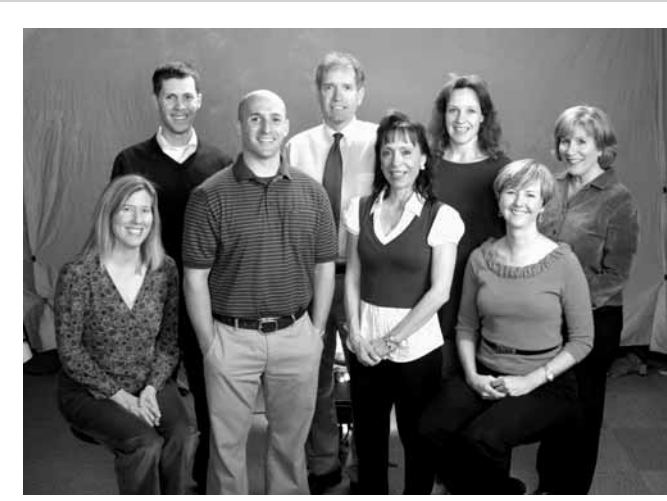
Stewardship Transformation Proposal Team

For outstanding work in developing new program-area value propositions and accompanying business and governance models to pilot a transformational stewardship model for Sandia National Laboratories.