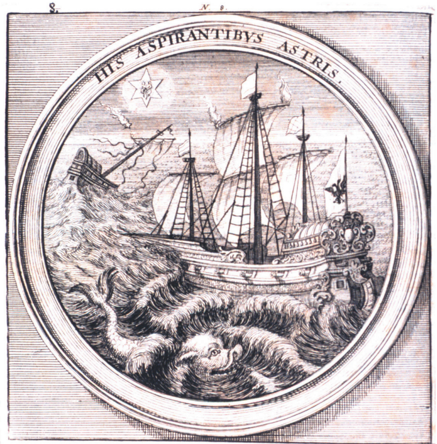
Storm, shipwreck, and sea monster.

In September 2003, NOAA’s Ocean Exploration Program visited a newly discovered shipwreck in the Stellwagen Bank National Marine Sanctuary on the coast of Massachusetts. Underwater archaeologists studied the wreck to learn more about what happened to cause the ship to sink. Now it’s your turn to be a Wreck Detective!