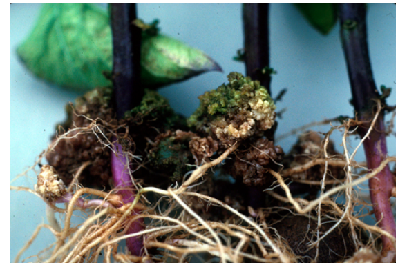
Stem galling on potato