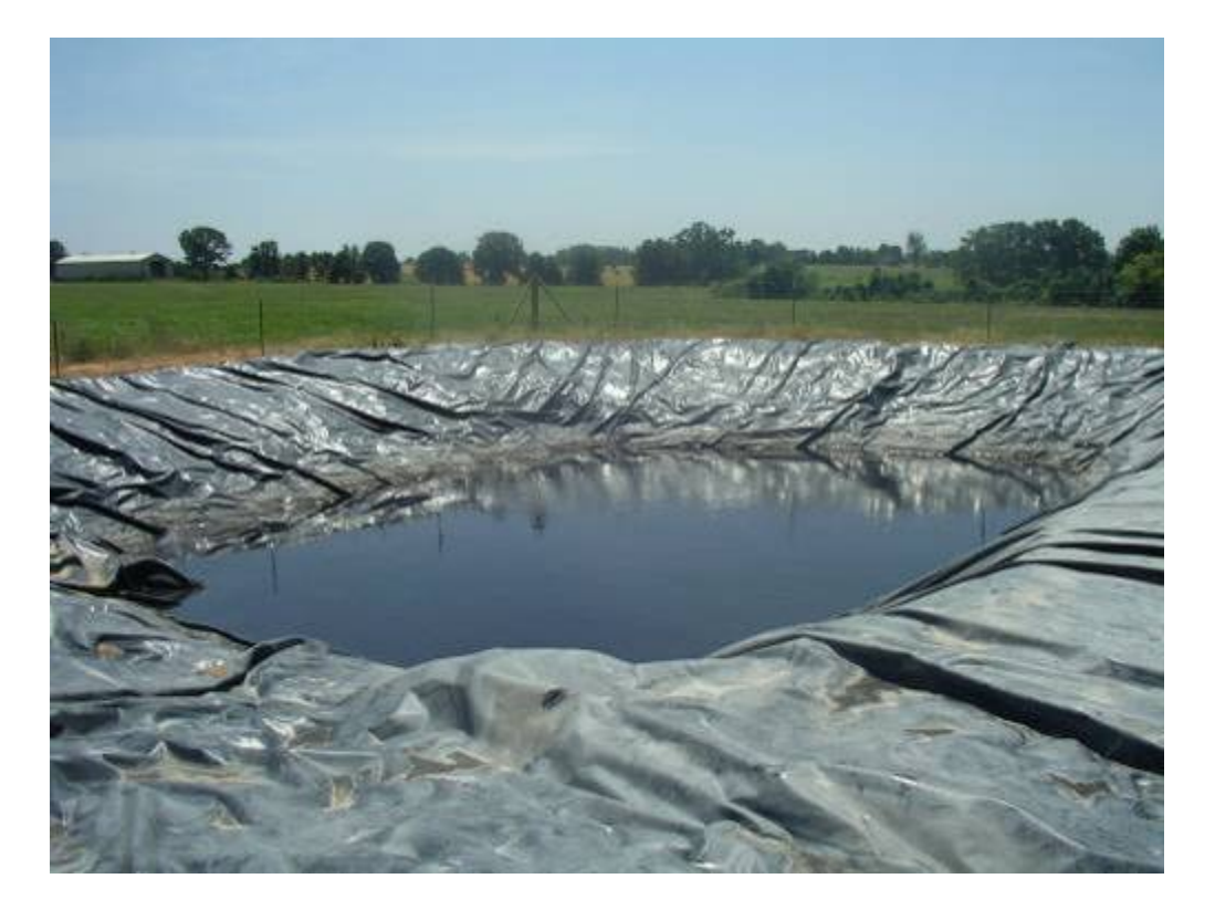
Figure 5 – Rig ditch pit.