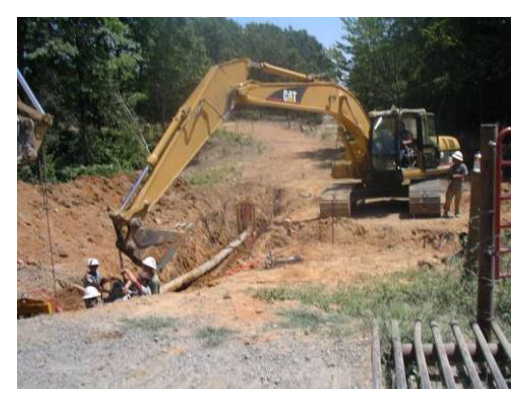
Figure 20 – Worker connecting pipeline sections. Pipeline corridor can be seen in the background.