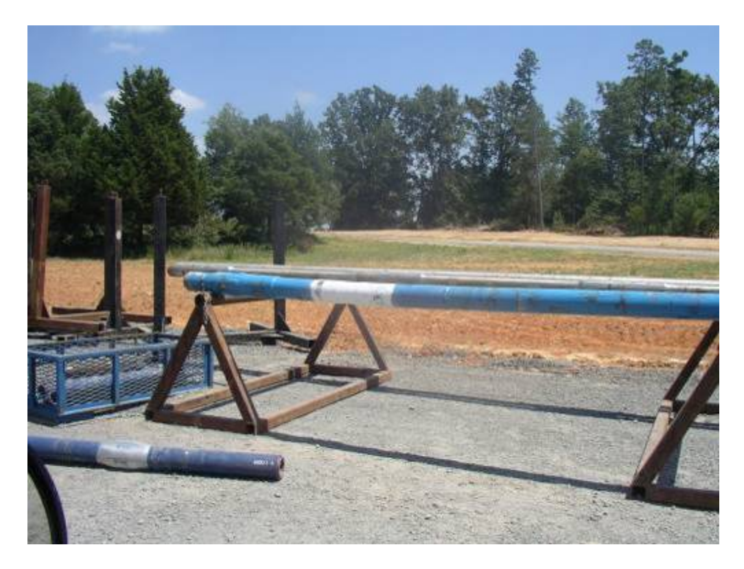
Figure 8 – Downhole drilling motor.