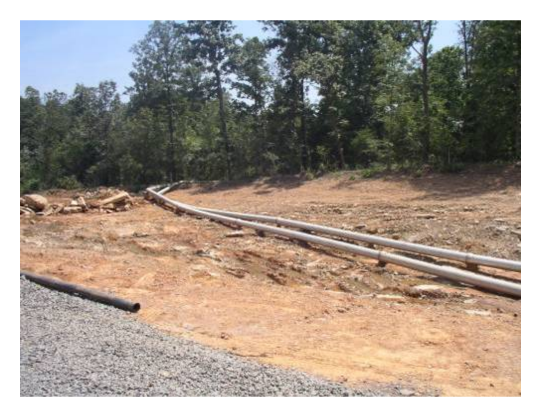
Figure 10 – Water pipeline conveying water for a frac job.