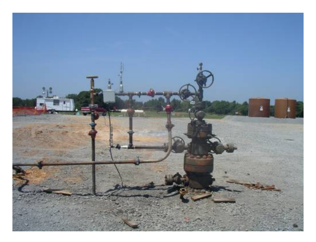
Figure 18 – Wellhead.