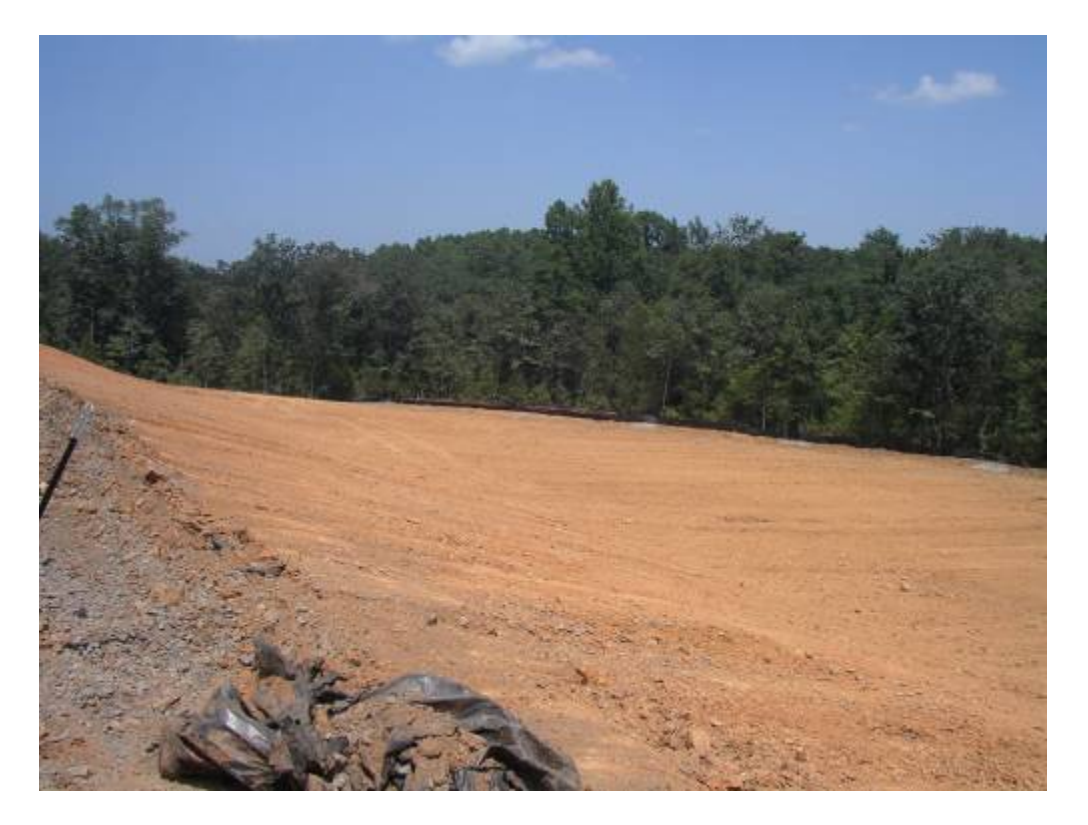
Figure 9 – Reclaimed reserve pit.