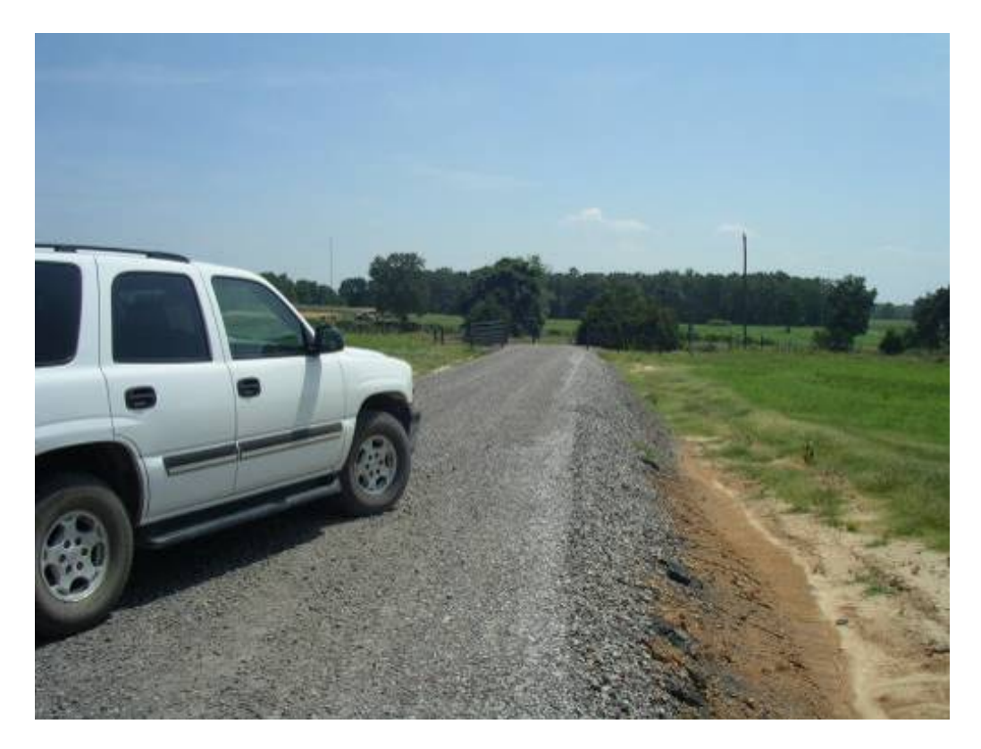
Figure 3 – Gravel access road.