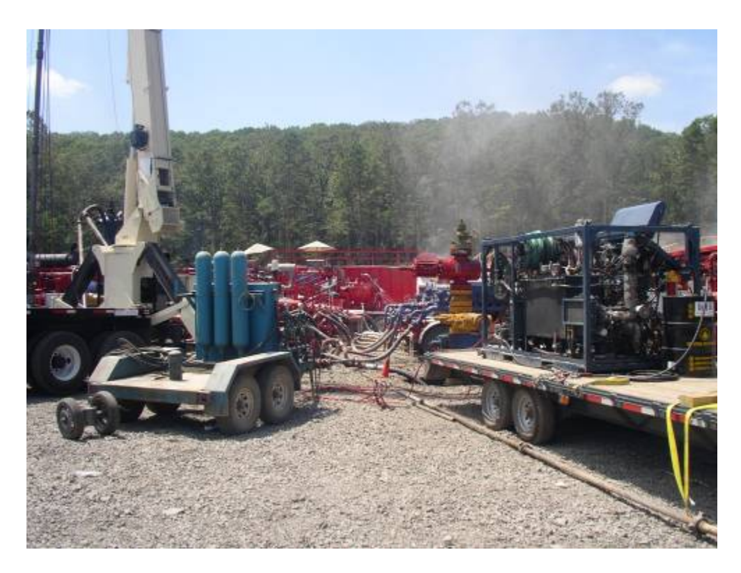
Figure 16 - The well being fracced is behind the white crane. The other wellhead near the middle of the picture was fracced on the previous day. In this case, two wells were constructed at the same well pad.

When the frac job is finished, SEECO brings in a coiled tubing rig to drill out the plugs that separated the sections of the horizontal leg of the well. Then a workover rig is used to install production tubing.