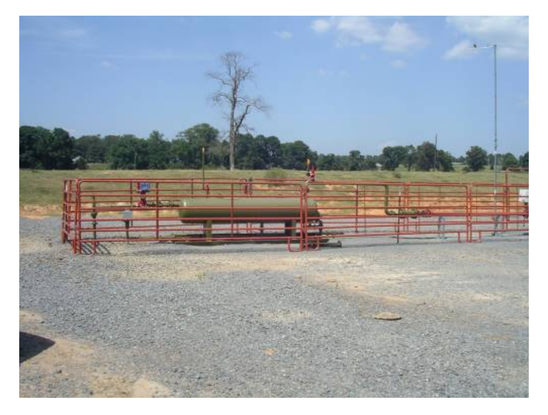
Figure 19 – Gas metering station at a producing well site.