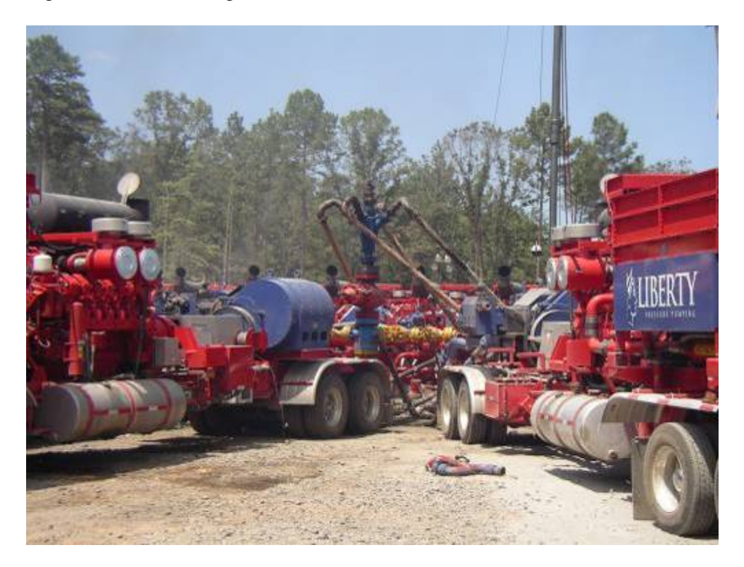
Figure 15 – The well being fraceed is in the middle, with the pipe conveying the injectate. The two trucks beside the well are pumping units.