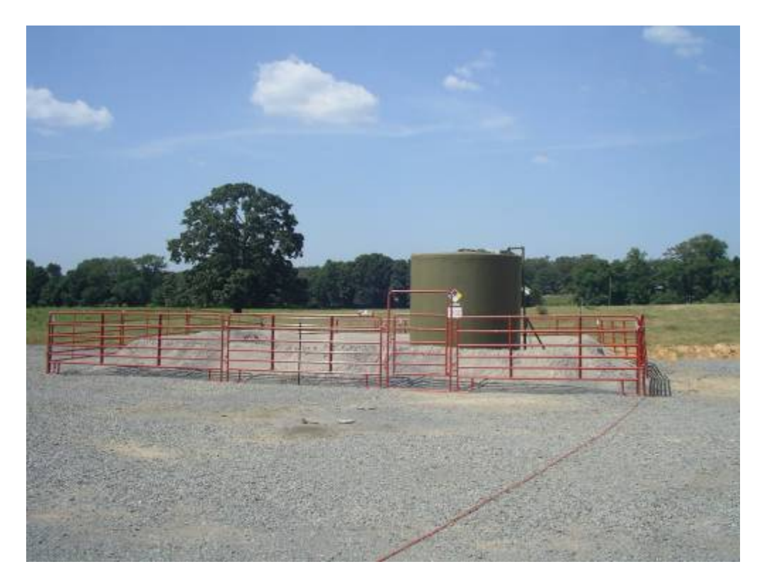
Figure 17 – Water storage tank at well site.

that are closer to its active sites. Active well sites generally have water storage tanks onsite. Figure 17 shows a water storage tank.