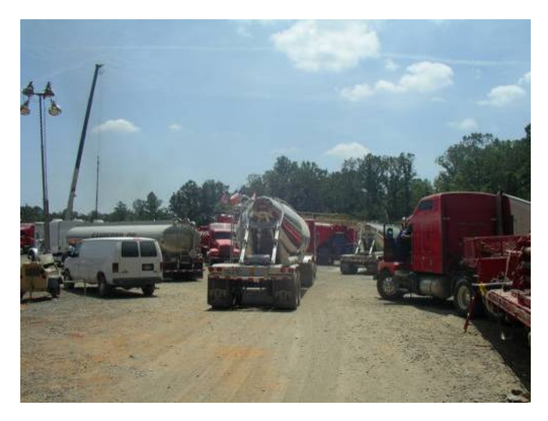
Figure 12 – One of several sand-hauling trucks in the center.