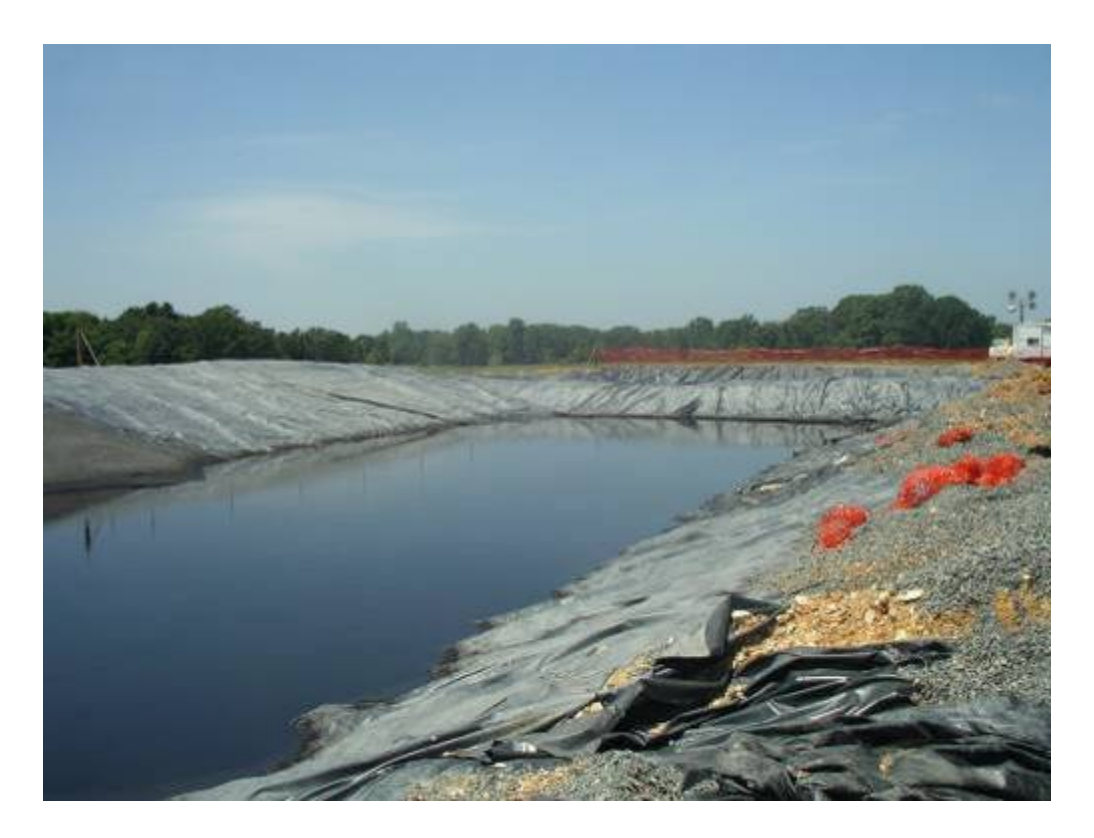
Figure 4 – Reserve pit.