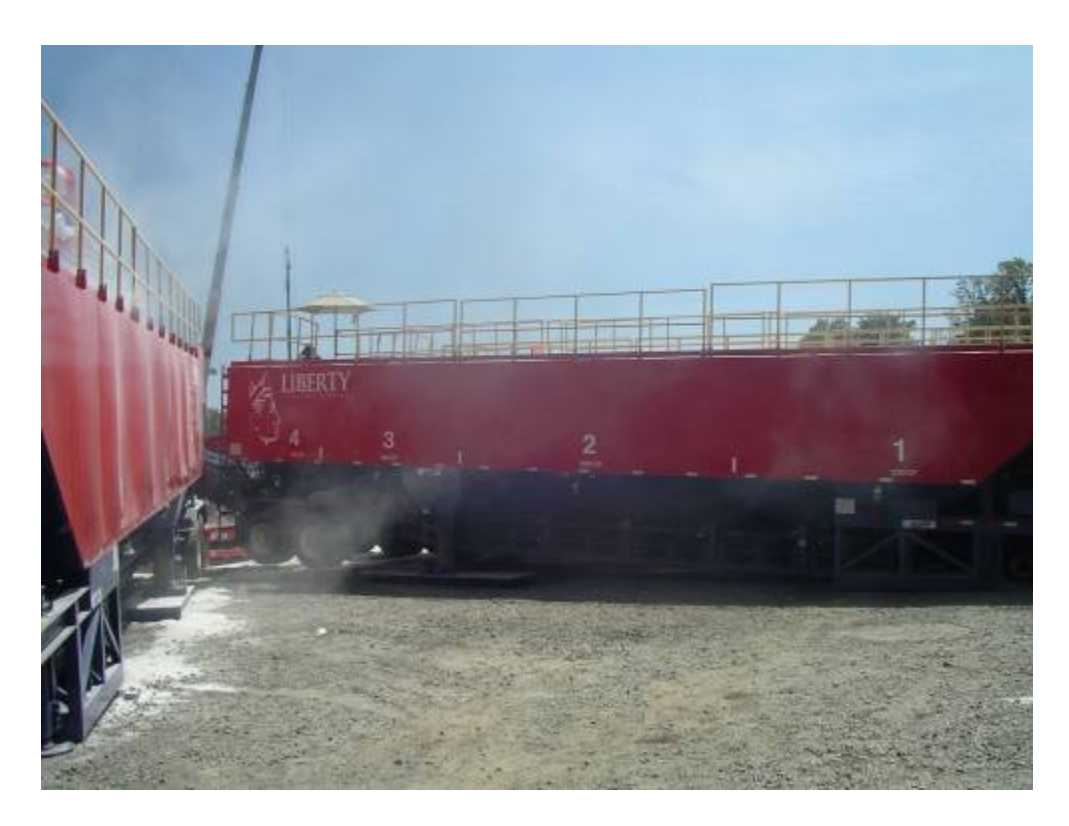
Figure 14 – Sand storage tanks.