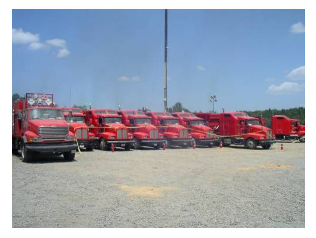
Figure 11 – Trucks lined up at the site of a frac job.