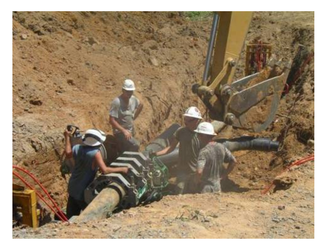
Figure 21 – Workers splicing plastic pipeline and connecting a junction line in the field.

Figure 20 – Worker connecting pipeline sections. Pipeline corridor can be seen in the background.