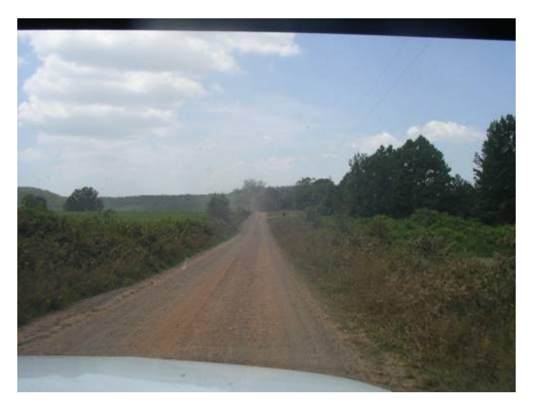
Figure 1 – View of typical "county road" that is the primary route used to get to gas well sites.

with commercial activity, we drove mostly through rural and agricultural areas. Route 65 is a four-lane road leading north from Conway. After about 45 minutes, we exited onto two-lane paved roads, which make up the main road network in these areas. At times, we turned onto some of the numerous "county roads" that were unpaved and had dirt and gravel surfaces. An example is shown in Figure 1. Those county roads were not designed to accommodate heavy traffic of large trucks and other oil field machinery.