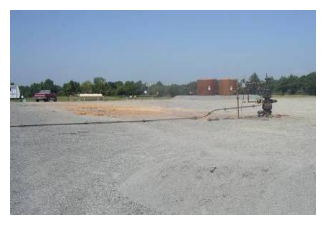
Figure 2 – Newly constructed well showing gravel pad.