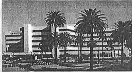
Building 500 (James W. Wadsworth Building) at West L.A. Campus

Submitted to: Department of Veterans Affairs Mail Code 049A3H 810 Vermont Avenue NW Washington, DC 20420