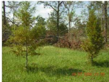
DSCN1212-MV_tree down on fence.JPG 2005/09/27 13:55:38