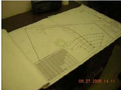
DSCN1219-MV_inside Plant_map of french drain layout.JPG 2005/09