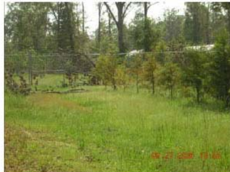
DSCN1214-MV_tree down on fence.JPG 2005/09/27 13:55:56