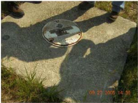
DSCN1227-MV_monitoring well.JPG 2005/09/27 14:39:08