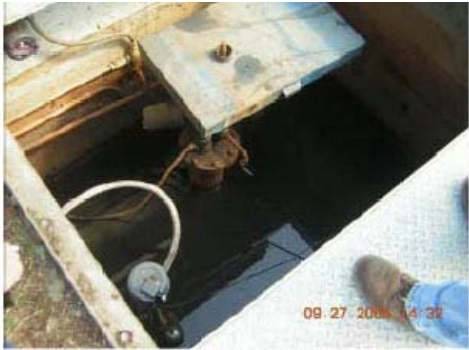
DSCN1225-MV_Recovery sump_may have been some flooding at high