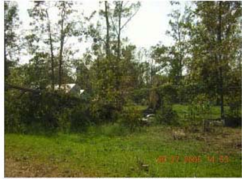
DSCN1234-MV_tree down.JPG 2005/09/27 14:53:51