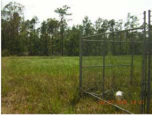
DSCN1233-MV_water well enclosure.JPG 2005/09/27 14:47:41