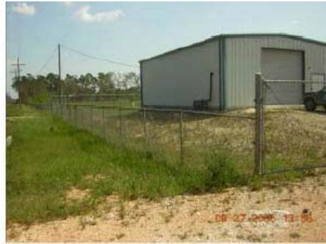
DSCN1210-MV_front gate_left.JPG 2005/09/27 13:55:02