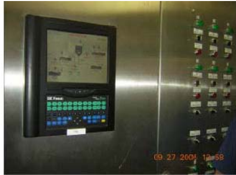
DSCN1218-MV_inside Plant_no flooding.JPG 2005/09/27 13:58:40