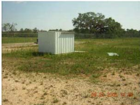
DSCN1221-MV_Plant outbuilding_not roof damage.JPG 2005/09/27 1