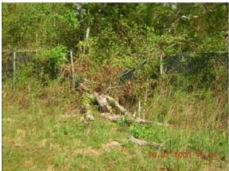
DSCN1231-MV_tree down on fence.JPG 2005/09/27 14:44:43