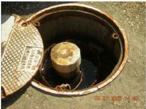
DSCN1229-MV_monitoring well.JPG 2005/09/27 14:40:41