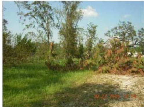
DSCN1236-MV_tree down.JPG 2005/09/27 14:54:05