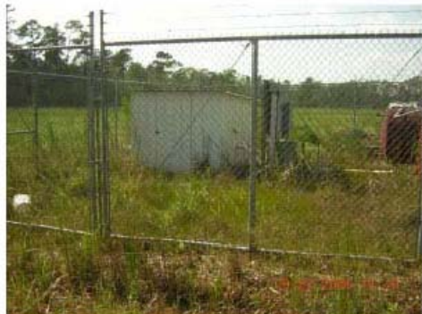
DSCN1232-MV_water well enclosure.JPG 2005/09/27 14:45:18