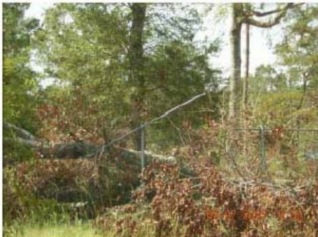
DSCN1213-MV_tree down on fence near front gate.JPG 2005/09/27 13:55:51