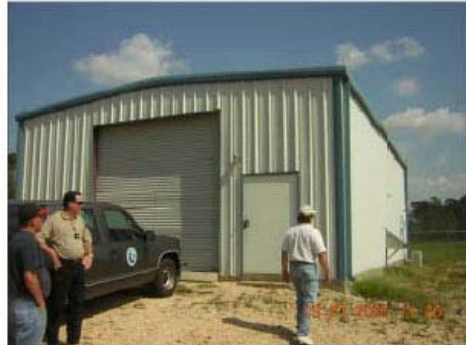
DSCN1220-MV_Plant_no flooding.JPG 2005/09/27 14:26:18