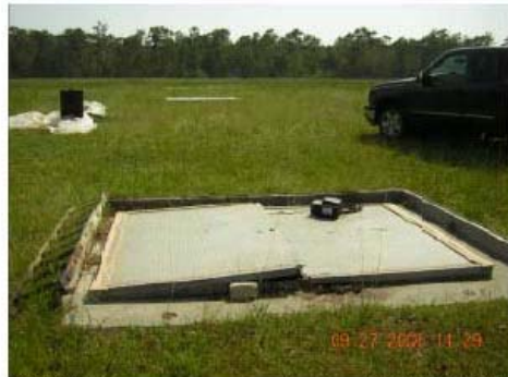
DSCN1222-MV_Recovery sumps_no flooding.JPG 2005/09/27 14:29