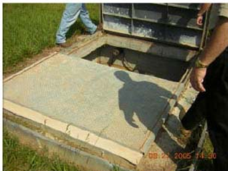
DSCN1223-MV_Recovery sump_no flooding.JPG 2005/09/27 14:30:0