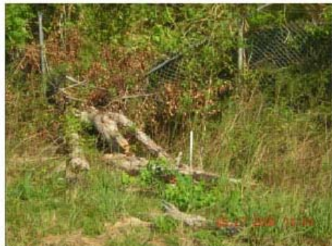
DSCN1230-MV_tree down on fence.JPG 2005/09/27 14:44:34