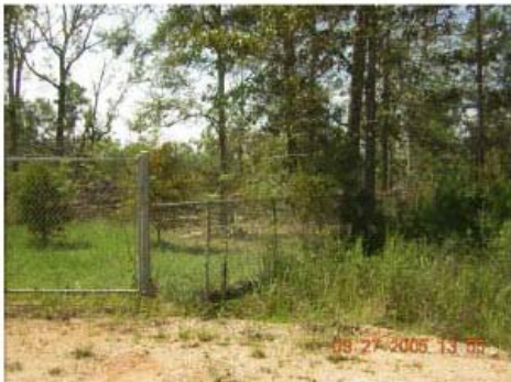
DSCN1211-MV_front gate_right.JPG 2005/09/27 13:55:15