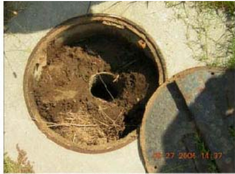
DSCN1226-MV_French drain access_note fire ants.JPG 2005/09/27