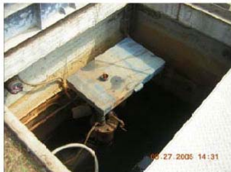
DSCN1224-MV_Recovery sump_may have been some flooding at hig