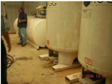
DSCN1215-MV_inside Plant_no flooding.JPG 2005/09/27 13:58:02