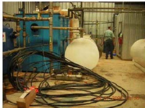
DSCN1216-MV_inside Plant_no flooding.JPG 2005/09/27 13:58:09