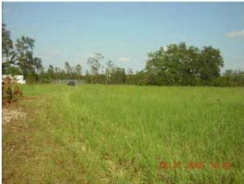
DSCN1235-MV_view across site.JPG 2005/09/27 14:53:58