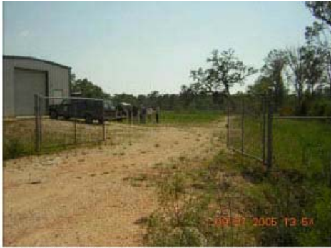
DSCN1209-MV_front gate.JPG 2005/09/27 13:54:48