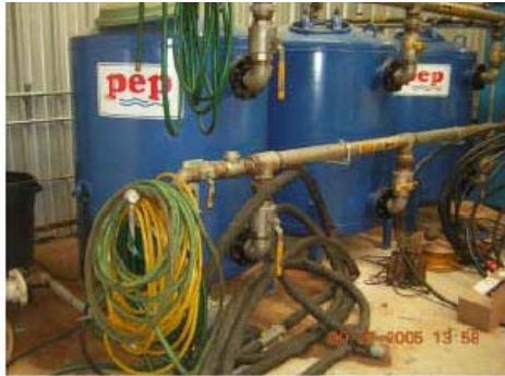
DSCN1217-MV_inside Plant_no flooding.JPG 2005/09/27 13:58:15