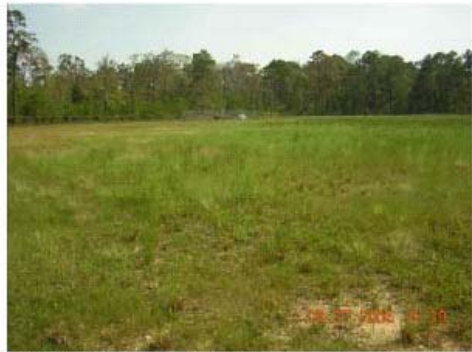
DSCN1228-MV_view across site to water well in corner.JPG 2005/09/27