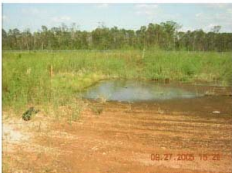
DSCN1242-DM_from front gate.JPG 2005/09/27 15:29:18