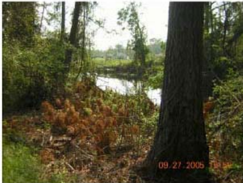
DSCN1256-DM_creek.JPG 2005/09/27 15:50:46