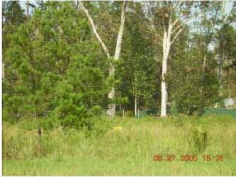
DSCN1246-DM_tree down across fence.JPG 2005/09/27 15:35:40