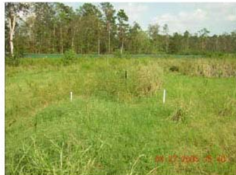
DSCN1249-DM_PRB.JPG 2005/09/27 15:40:30