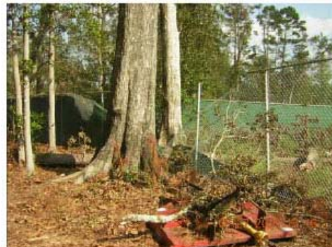
DSCN1251-DM_tree down on fence.JPG 2005/09/27 15:46:15