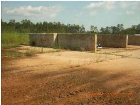
DSCN1240-DM_from front gate.JPG 2005/09/27 15:29:07