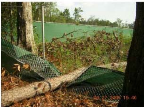
DSCN1252-DM_tree down on fence.JPG 2005/09/27 15:46:37