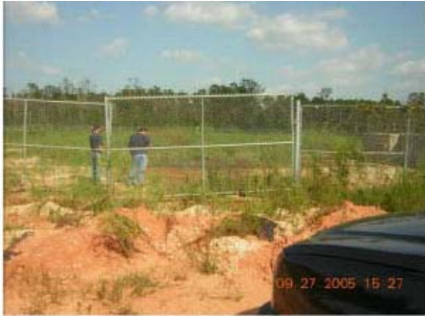
DSCN1238-DM_front gate.JPG 2005/09/27 15:27:04