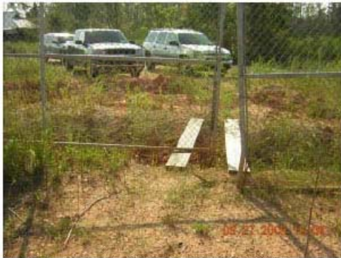
DSCN1258-DM_front gate.JPG 2005/09/27 16:06:10