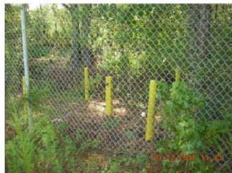
DSCN1245-DM_monitoring well outside perimeter fence.JPG 2005/09/27 15:30:00