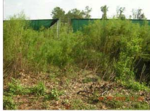
DSCN1255-DM_Perimeter fence_some view barrier damage.JPG 2005/09/27 15:50:46