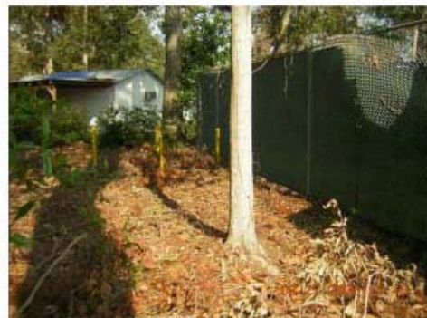
DSCN1253-DM_tree down on fence.JPG 2005/09/27 15:46:50