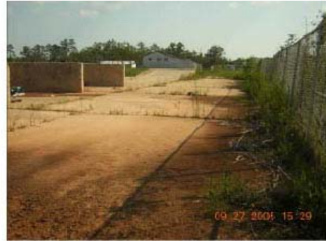
DSCN1239-DM_right from front gate.JPG 2005/09/27 15:29:02