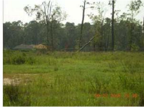
DSCN1247-DM_tree down across fence.JPG 2005/09/27 15:36:26