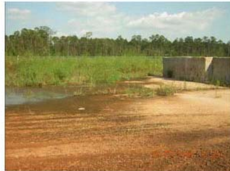
DSCN1241-DM_from front gate.JPG 2005/09/27 15:29:13