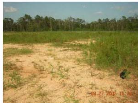
DSCN1243-DM_from front gate.JPG 2005/09/27 15:29:24