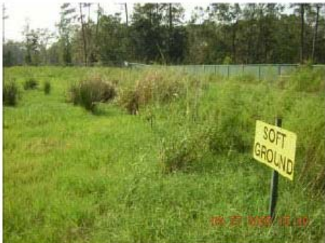
DSCN1248-DM_PRB.JPG 2005/09/27 15:40:03