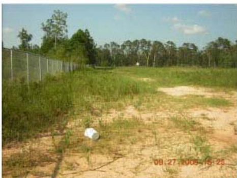
DSCN1244-DM_from front gate.JPG 2005/09/27 15:29:29