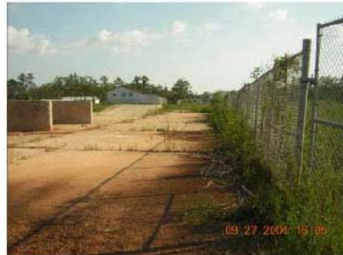
DSCN1257-DM_front gate.JPG 2005/09/27 16:05:44