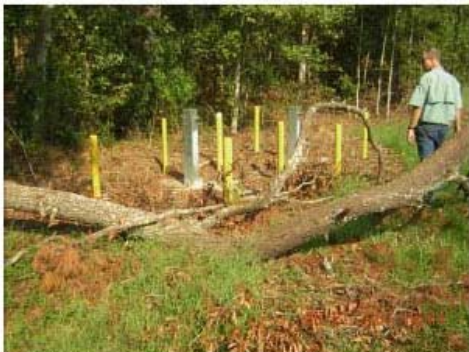
DSCN1250-DM_tree down adj to well outside fence.JPG 2005/09/27 15:46:15