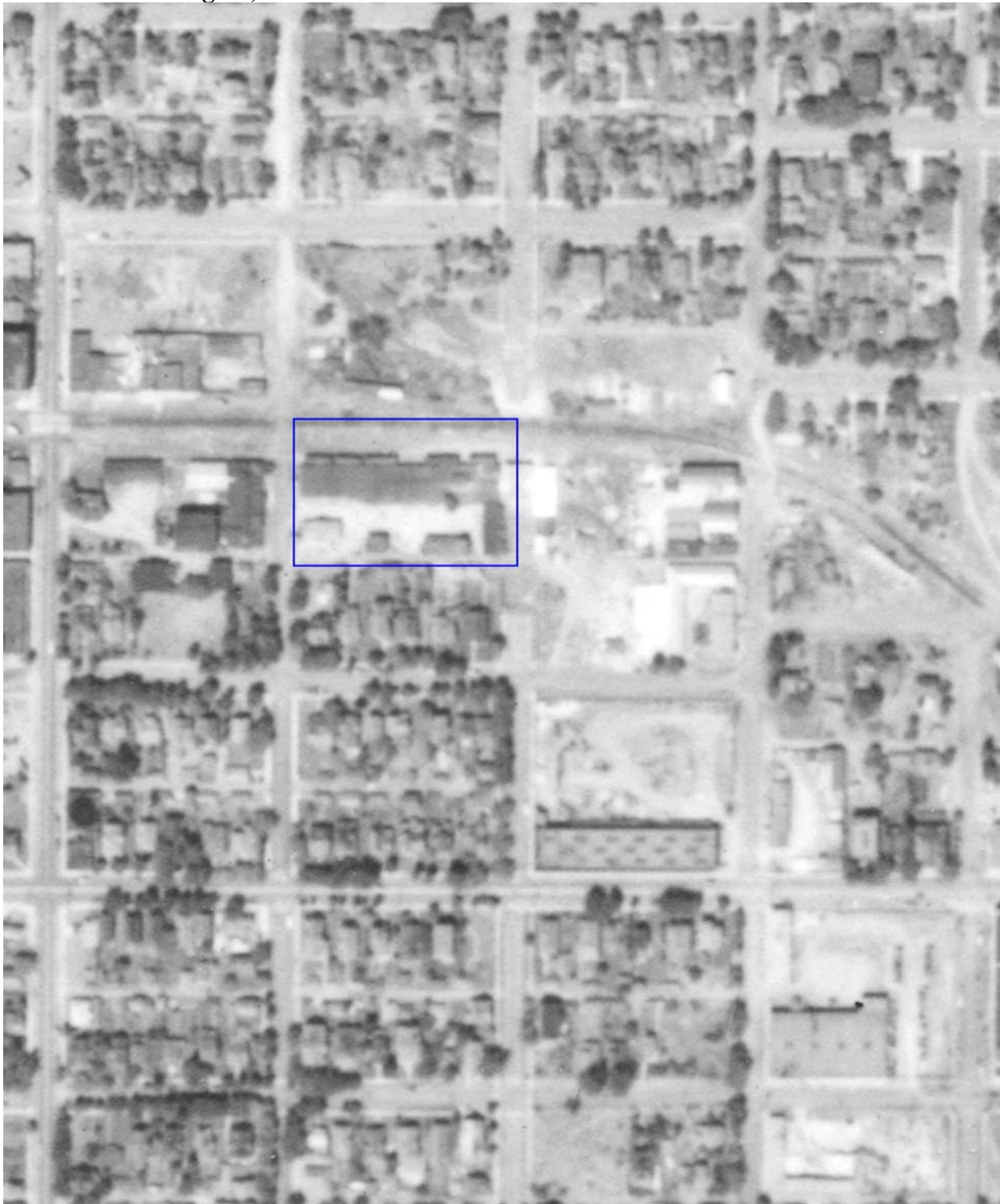
Figure 2 - Aerial Photograph of Vermiculite NW (outlined in blue) and Vicinity. Spokane, Washington, 1950.