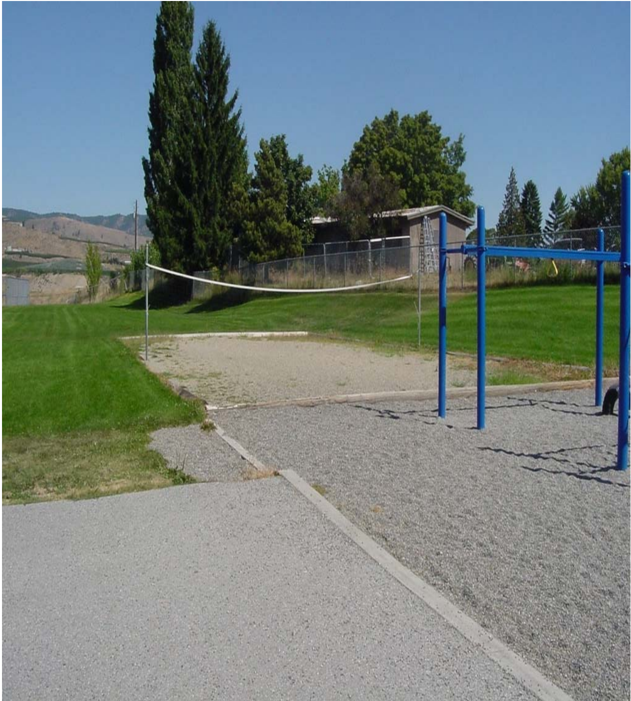
Figure 4. Manson playfields, Chelan Washington.