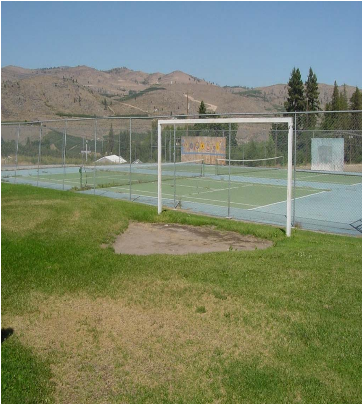
Figure 3. Manson soccer field Chelan, Washington.