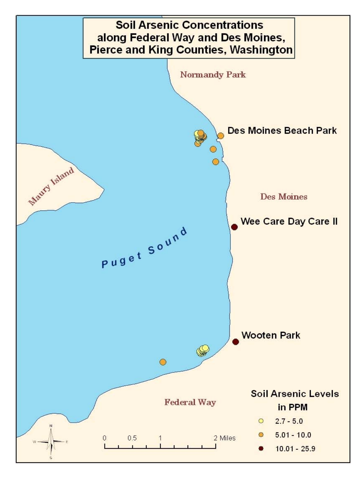
Figure 2. Soil arsenic levels at Federal Way and Des Moines sites, Pierce and King County, Washington.