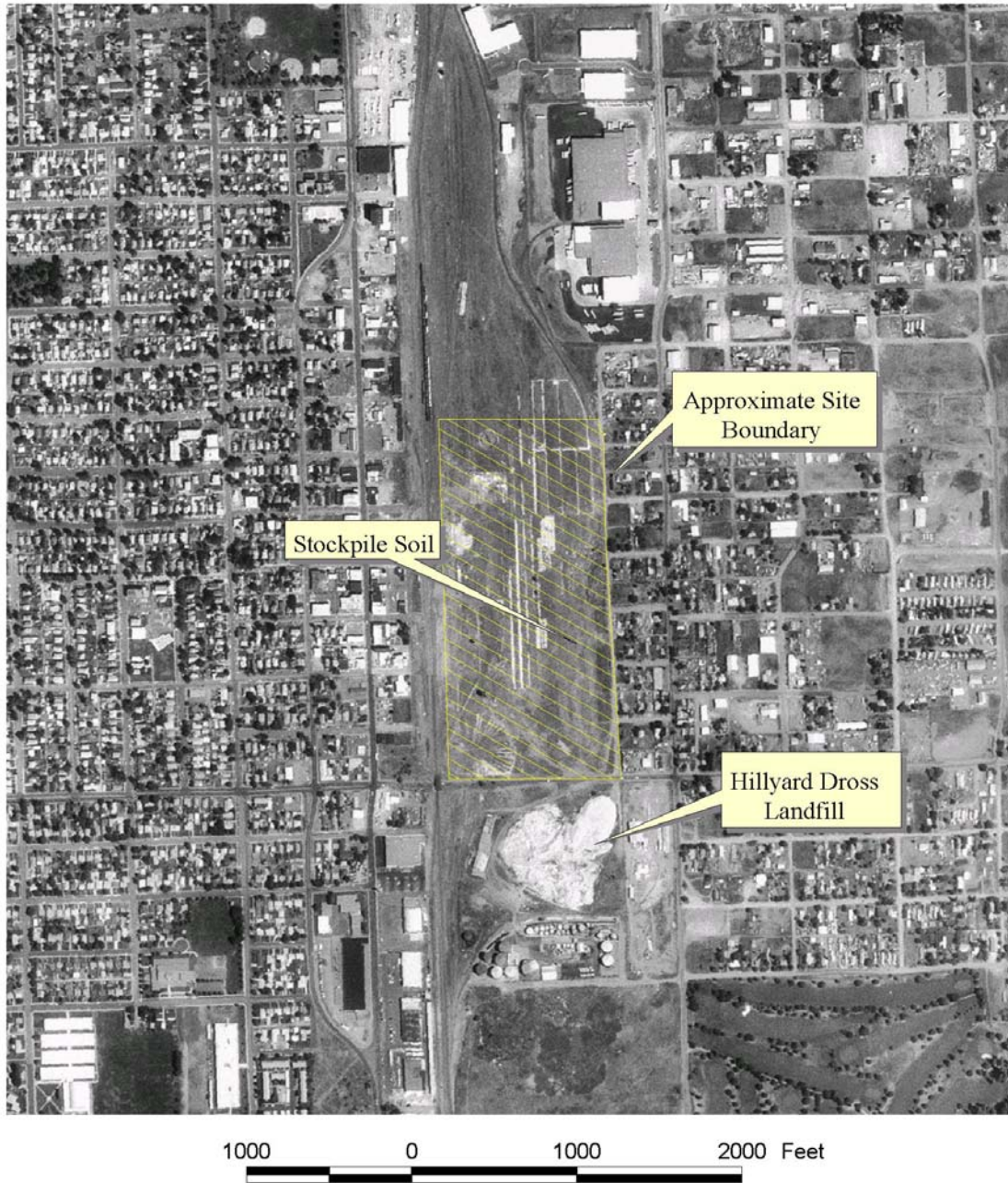
Figure 2: Aerial photograph of Hillyard area, Spokane, Washington, showing the lead contaminated site, July 16, 1995.