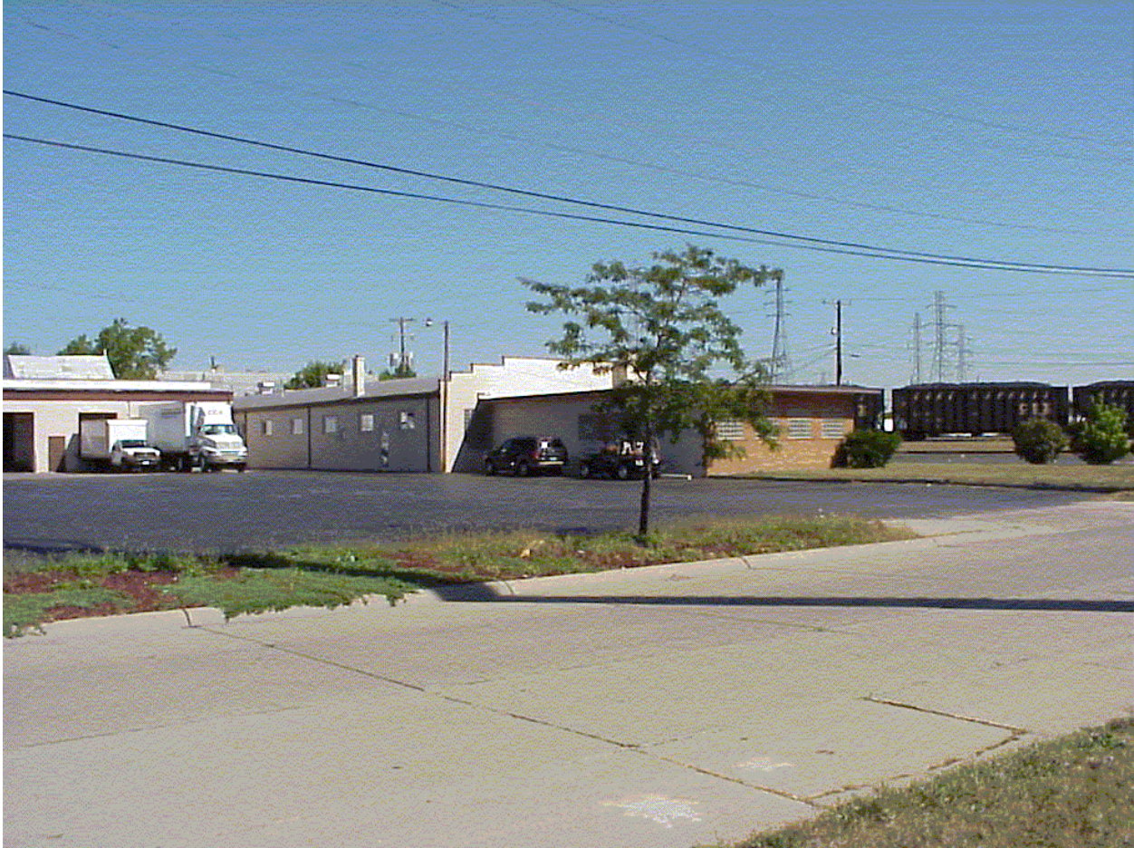
Figure 3. View of site, facing northeast. The railroad line is visible in the background. When the plant was active, this railroad line would transport vermiculite from Libby, Montana, into the facility for processing.