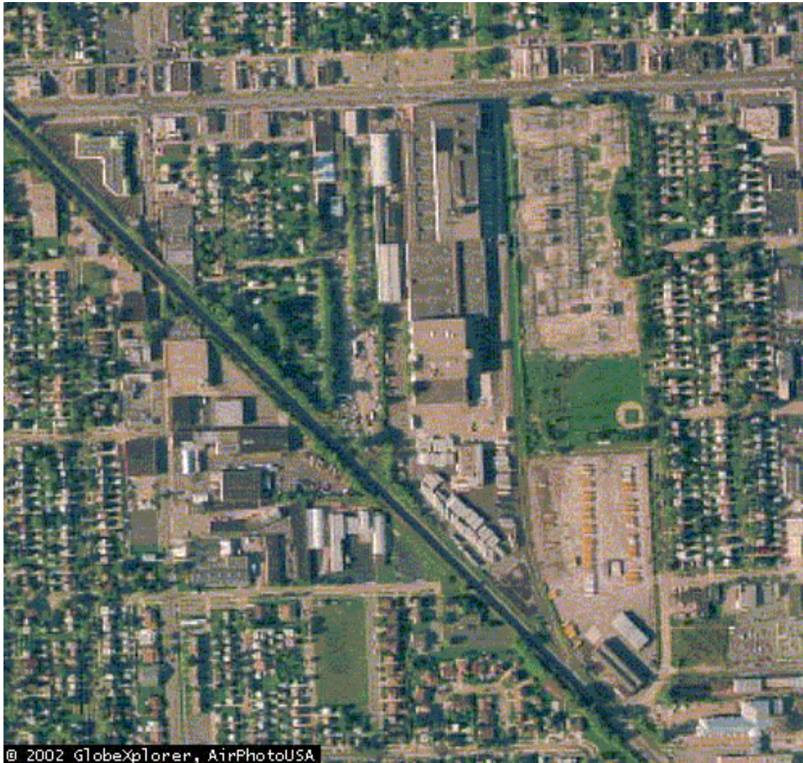
Figure 2. Aerial photo of site (shaded blue). Visible are the soccer field immediately south of property and the school bus garage to the east. Approximate scale: 1" = 0.10 miles.