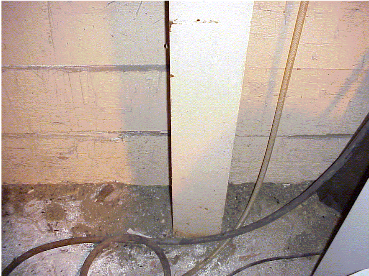
Figure 4. Looking down toward floor with slat wall in background. Libby asbestos-contaminated material (grayish substance) is visible at the bottom of the wall. Material escapes from the wall cavity through a gap between the lowest slat and the concrete floor.