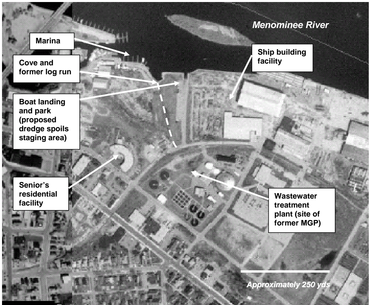
Figure 1. Location of Marinette former manufactured gas plant and surrounding area.