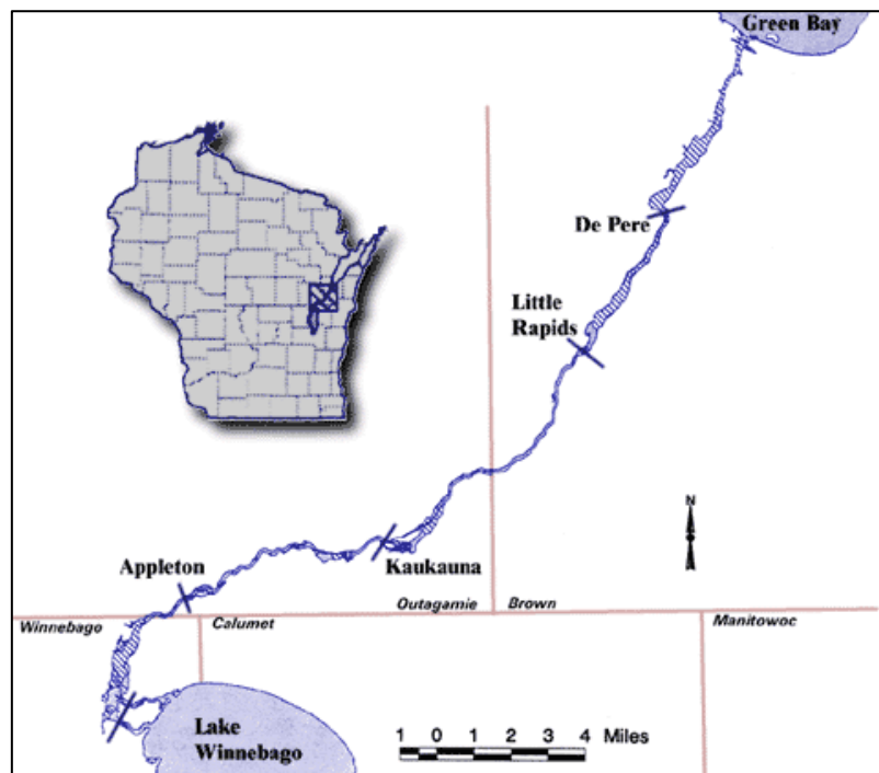
Figure 1: Location of the Lower Fox River between Lake Winnebago and Green Bay in Northeastern Wisconsin.

The minority population has grown rapidly in Fox Valley communities. From 1990 to 2000 Green Bay has had the largest increase in Hispanic or Latino population of any City in Wisconsin (470%). The Hispanic or Latino population has grown from 906 in 1980, to 1,525 in 1990, to 8,698 in 2000. The Hmong population in Green Bay increased by 90.5%; to 2,629 people between 1990 and 2000. In 2000 11.3% of the population of Green Bay report that a language other than English is spoken at home (UW, 2000a,b,c).