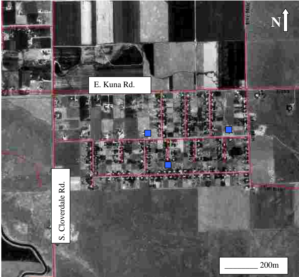
Figure 2: Aerial photograph of Desert View Estates. Blue squares represent locations of the 3 active wells.