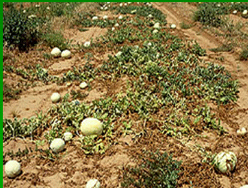
Pumpkin patch affected by yellow vine disease, 1992