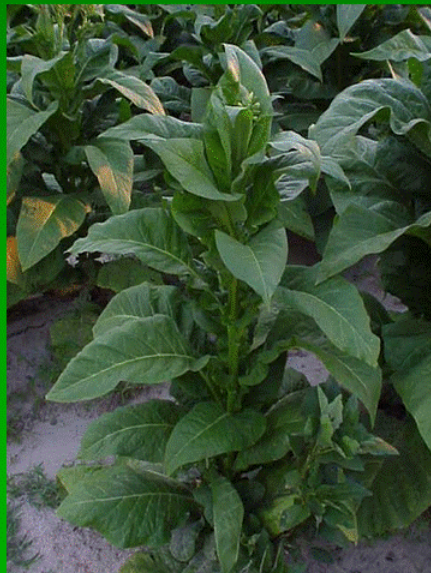
Tobacco – Nicotiana