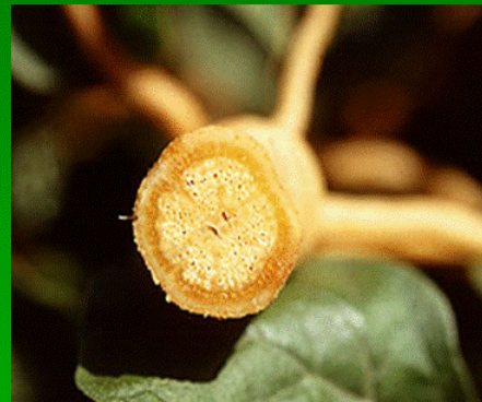
Pumpkin vine cross section Yellow vine disease