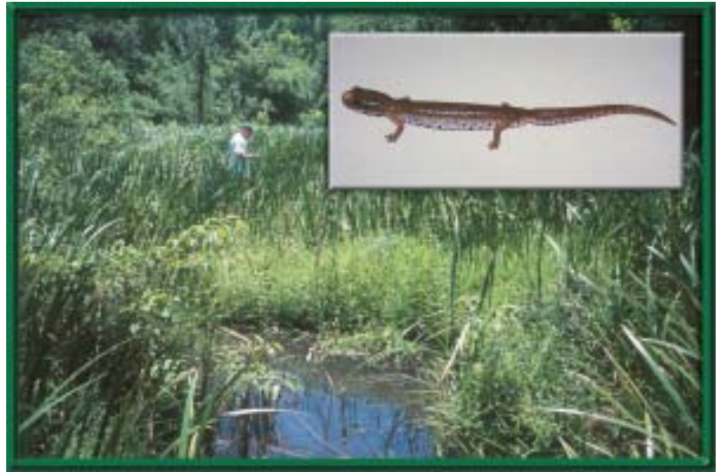
Hembree Marsh provides habitat for some rare aquatic and terrestrial animal species, including the four-toed salamander.

Many sites on the ORR where rare animal species or populations occur have been designated as natural areas. Several designated aquatic natural areas provide habitat for the Tennessee dace. Although these natural areas are not large, they help preserve populations of rare animals.