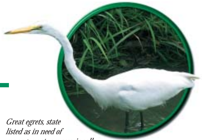
Great egrets, state listed as in need of management, are occasionally seen near streams and ponds on the ORR.

More than 30 rare animal species can be found on the Department of Energy's (DOE's) Oak Ridge Reservation (ORR)—some are full-time residents, while others are transient. Species are considered to be rare when they have low population numbers or limited distribution, making them susceptible to extinction. The state and federal governments categorize the rarest animal species as endangered, threatened, or in need of management.