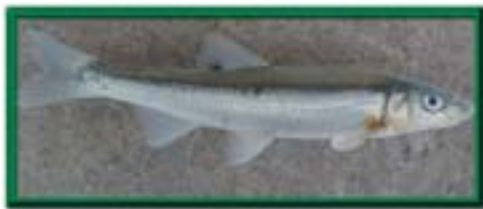
This spotfin chub was found in East Fork Poplar Creek just outside the ORR. Although not yet observed on the ORR, the species is likely to occur there.

In addition to habitat preservation, good forest management and field maintenance help maintain and enhance habitats for rare animals on the ORR. Forest management includes selective thinning of hardwood trees (a past practice that could be done again), minimizing and eliminating nonnative species such as autumn olive or tree of heaven, and burning some areas. A program to restore native grass communities on the ORR is also helping native wildlife.