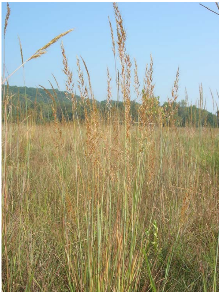
Fig. 2. Indian grass ( Sorghastrum nutans ) showing seed heads.