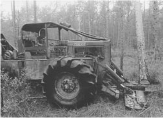
Logging workers use increasingly productive machinery to harvest logs.

heavy labor. Loggers work under unusually hazardous conditions. Falling branches, vines, and rough terrain are constant hazards, as are the dangers associated with tree-felling and log-handling operations. Special care must be taken during strong winds, which can even halt logging operations. Slippery or muddy ground, hidden roots, or vines not only reduce efficiency, but also present a constant danger, especially in the presence of moving vehicles and machinery. Poisonous plants, brambles, insects, snakes, heat, humidity, and extreme cold are everyday occurrences where loggers work. The use of hearing protection devices is required on logging operations because the high noise level of felling and skidding operations over long periods may impair one's hearing. Workers must be careful and use proper safety measures and equipment such as hardhats, eye and ear protection, safety clothing, and boots to reduce the risk of injury.