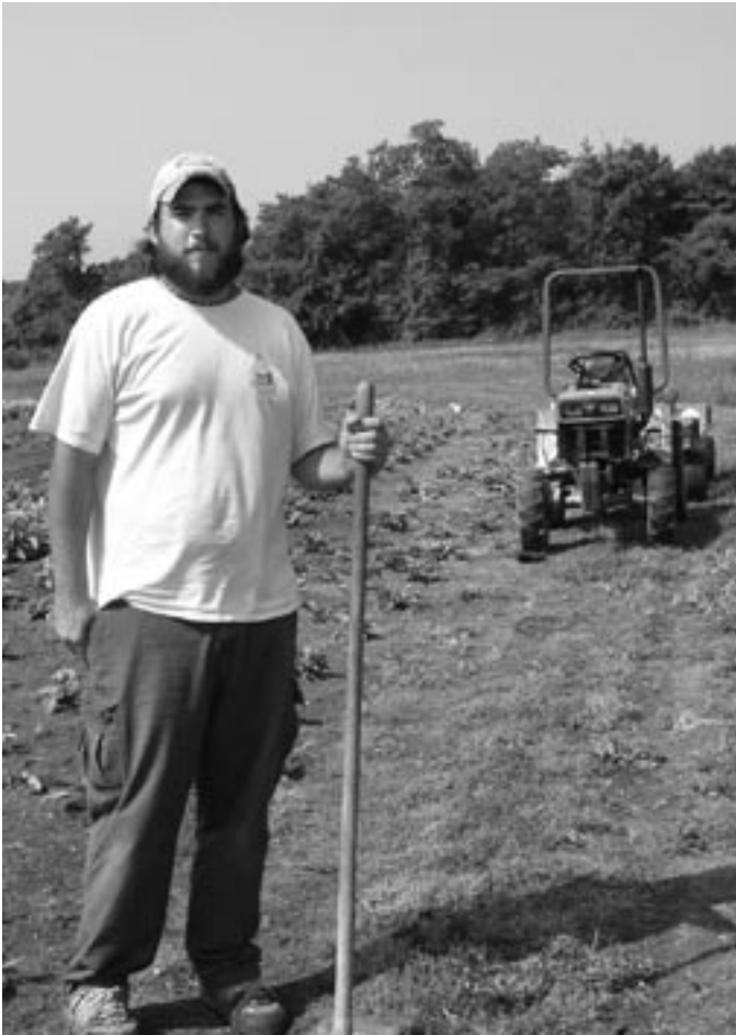
Farmers need in-depth knowledge of many kinds of crops.

portation and storage requirements; and oversee maintenance of the property and equipment.