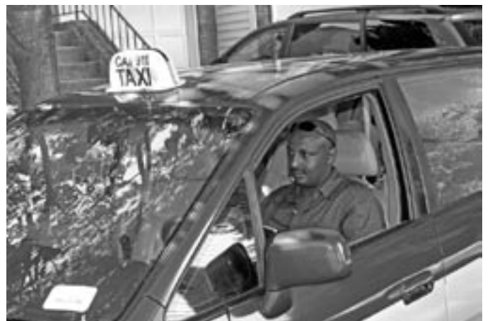
Taxi drivers may work shifts at all times of the day and night.

Chauffeurs cater to passengers by providing attentive customer service and paying attention to detail. They help riders into the car by holding open doors, holding umbrellas when it is raining, and loading packages and luggage into the trunk of the car. Chauffeurs may perform errands for their employers such as delivering packages or picking up clients arriving at airports. To ensure a pleasurable ride in their limousines, many chauffeurs offer conveniences and luxuries such as newspapers,