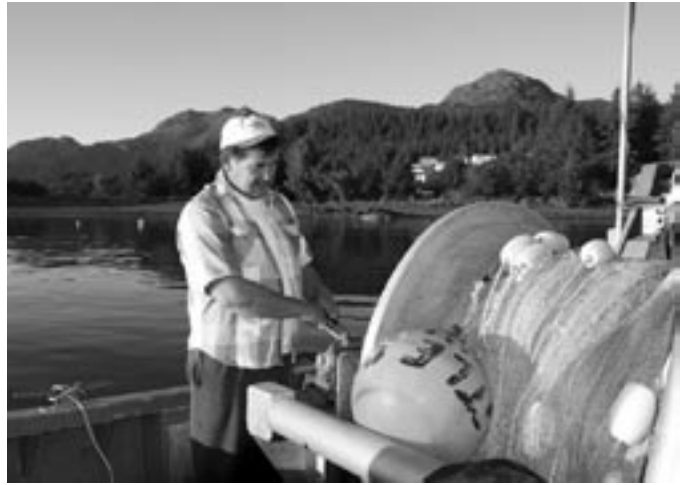
Fishers often work near the coast.

Large fishing vessels that operate in deep water generally have technologically advanced equipment, and some may have facilities on board where the fish are processed and prepared for