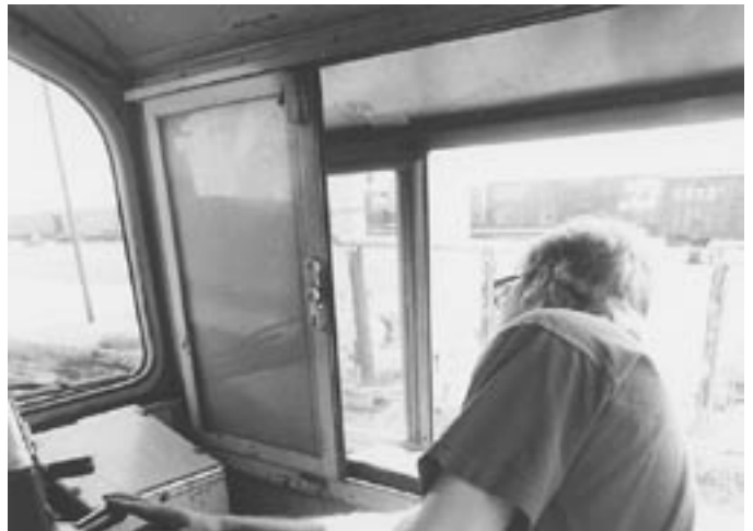
Rail transportation workers may spend significant time on the road.

Freight trains generally are dispatched according to the needs of customers; as a result train crews may have irregular schedules. It is common for workers to place their name on a list and wait for their turn to work. Jobs usually are assigned on short notice and often at odd hours. Working weekends is common in freight train transportation. Those who work on trains operating between points hundreds of miles apart may spend consecutive nights away from home. Because of the distances involved on some routes, many railroad employees work without direct supervision.