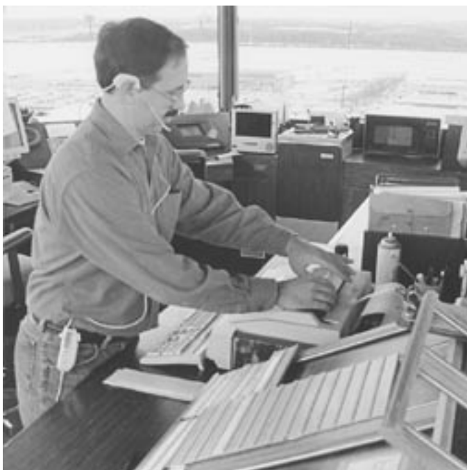
Air traffic controllers are primarily concerned with safety, but they also must direct planes efficiently to minimize delays.

The radar controller, who is the senior team member, observes the planes in the team's airspace on radar and communicates with the pilots when necessary. Radar controllers warn