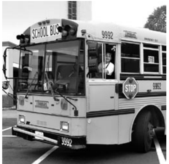
Bus drivers are responsible for the safety of passengers.

Licensure. Bus driver qualifications and standards are established by State and Federal regulations. All drivers must comply with Federal regulations and with any State regulations that exceed Federal requirements. Federal regulations require drivers who operate commercial motor vehicles in excess of 26,000 pounds gross vehicle weight rating or designed to carry 16 or more people, including the driver, to hold a commercial driver’s license with the appropriate endorsements from the State in which they live. As with all commercial drivers, bus drivers who drive across State or national boundaries, as motor coach drivers frequently do, must comply with U.S. Depart-