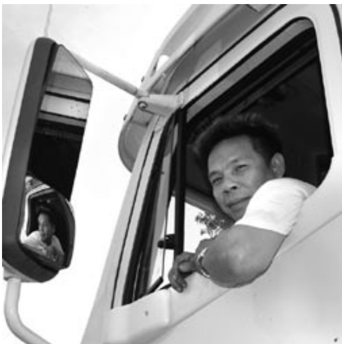
Overall job opportunities for truck drivers should be favorable.

Satellites and the Global Positioning System link many trucks with their company's headquarters. Troubleshooting information, directions, weather reports, and other important communications can be instantly relayed to the truck. Drivers can easily communicate with the dispatcher to discuss delivery schedules and what to do in the event of mechanical problems. The satellite link also allows the dispatcher to track the truck's location, fuel consumption, and engine performance. Some drivers also work with computerized inventory tracking equipment. It is im-