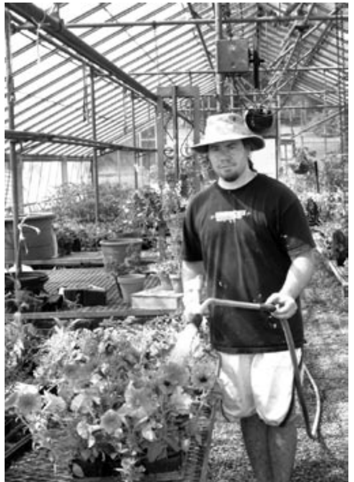
Agricultural workers tend to flowers or crops in nurseries and greenhouses.

The education and training requirements for animal breeders vary with the type of breeding they do. For those who breed livestock and other large or expensive animals, a bachelor's or