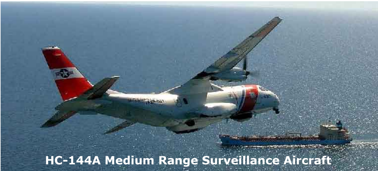
HC-144A Medium Range Surveillance Aircraft

The USCG Acquisition Directorate is committed to delivering and supporting state-of-the-market platforms and systems that are affordable, efficient and mission-capable.