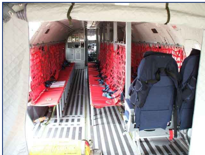
HC-144A Interior, Troop Transport Configuration.