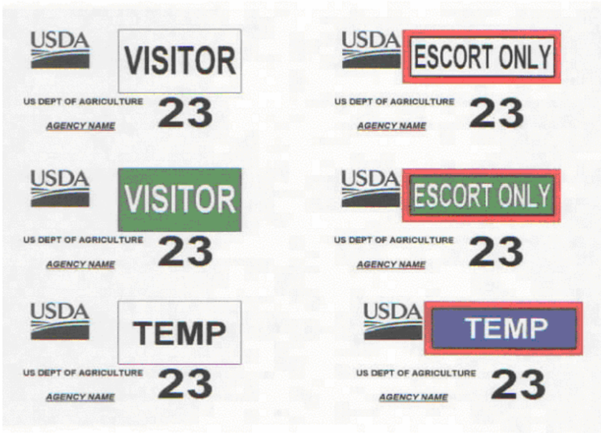
Exhibit 3 continued