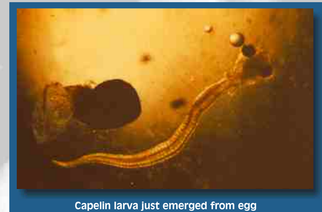
Capelin larva just emerged from egg

100 fish (any number will do) in plastic bag and freeze. Especially important if species identity is in doubt!