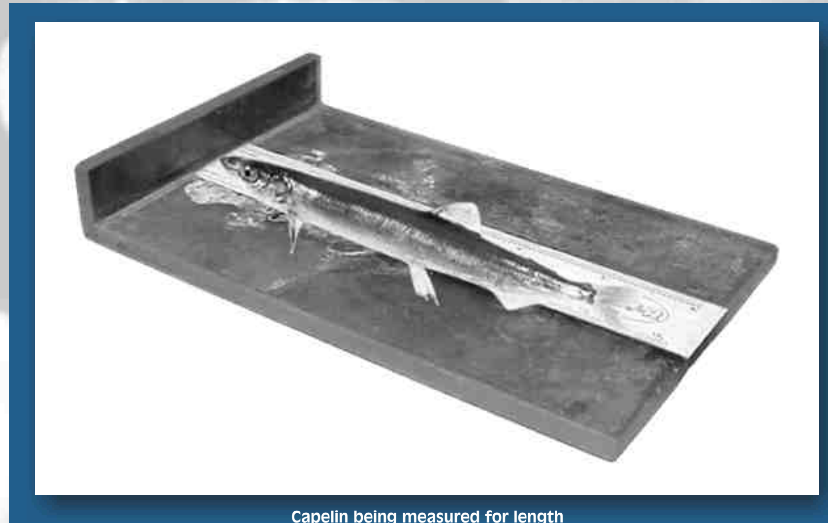
Capelin being measured for length

These small schooling fish prefer sandy/fine gravel beaches for spawning such as Roslyn Beach at Cape Chiniak and White Sand Beach and Pillar Creek Beach in Monashka Bay.