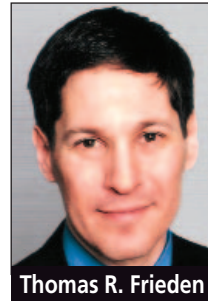
Thomas R. Frieden