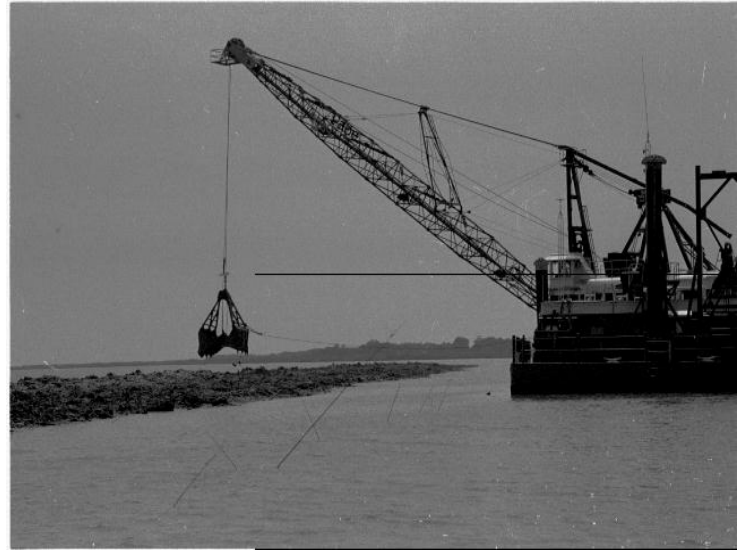
The proposed terraces at Four Mile Canal will be constructed in a similar fashion as shown above. The above photo is of the Captain Buford Berry constructing terraces at the project at Little Vermilion Bay (TV-12).

Reduction of shoreline erosion will be achieved by the buffering capacity of the constructed terraces. The proposed terrace layout is very different for each area of the project. The "fish net" design for Little Vermilion Bay is designed to allow sediment deposition and the terraces in Little White Lake are aligned to reduce the wind-generated waves, thus reducing shoreline erosion. Thus, marsh habitat will be created in two ways within the Four Mile Canal Terracing Project area. First, marsh will immediately be built by creating approximately 90 terraces from dredged material and planting them with smooth cordgrass. This action alone will create 70 acres of subaerial land. Second, by reducing fetch and wave energy, terraces will promote the deposition of suspended sediments in the shallow water adjacent to the terrace edges in Little Vermilion Bay and Little White Lake. This will slowly build marsh over the life of the project as subaerial land is built and plants naturally become established.