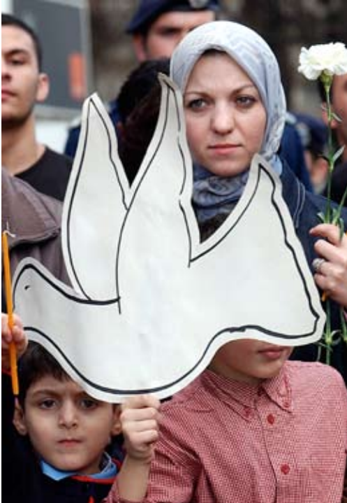
Romanian demonstrators against terrorists in 2004.