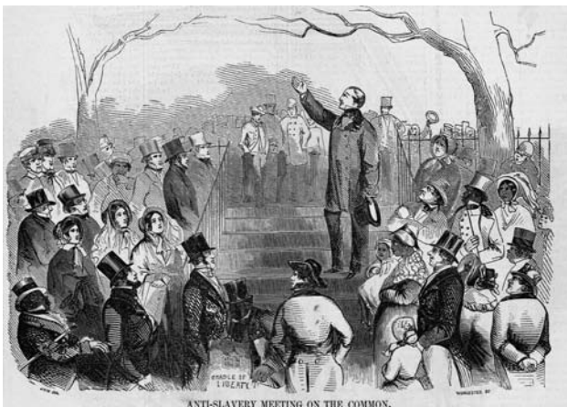
Abolitionist Wendell Phillips delivers an antislavery speech on the Boston Common in April 1851.

The distinctive American contribution came when other Christians, who were deeply involved in the conflicts of society, decided on principle to pursue political and social change using only nonviolent means. The process began in colonial times, before the United States declared its independence from Britain, among members of the Society of Friends, known as Quakers. Their strict commitment to nonviolence led some of them to oppose the payment of taxes for war, the enslavement of African Americans, and the persecution and displacement of Native American peoples. But the Quakers were primarily a religious group, whose beliefs led them to nonviolence.