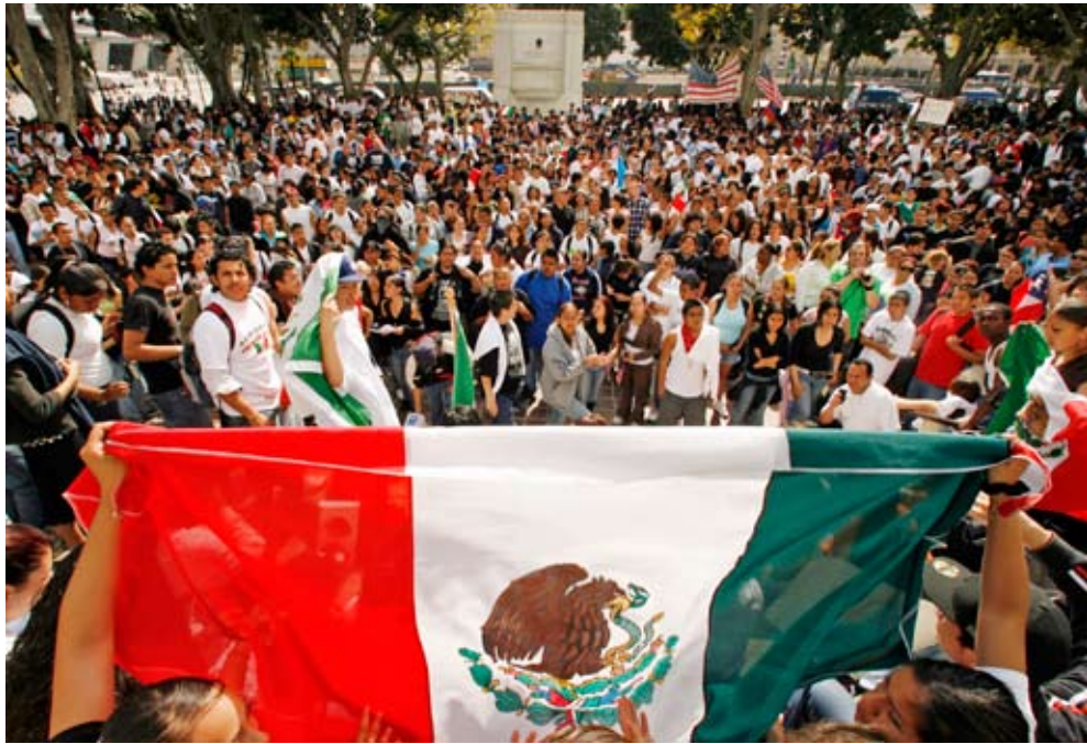
Using communication tools, Los Angeles students organized a surprise demonstration 30,000 strong.