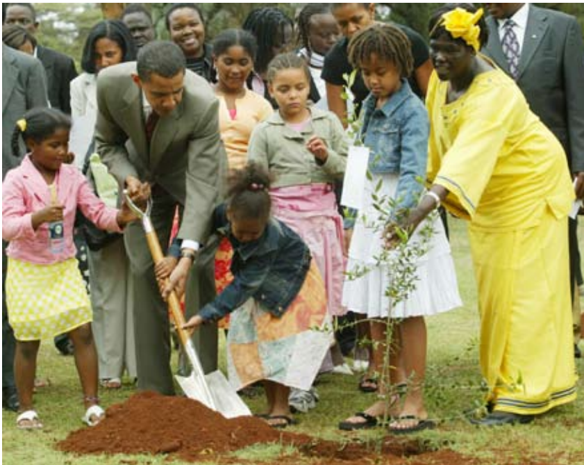
Wangari Maathai, right, plants a tree in Nairobi, Kenya, in 2006 with Barack Obama.

There is no single formula for implementing meaningful social change in a world of such daunting complexity and diversity. Yet this world offers enormous opportunities to those with vision and dedication to reach unprecedented numbers of people and build powerful programs based on the principles of nonviolence, progress, and hope. Here are seven individuals who demonstrate how such change can be accomplished.