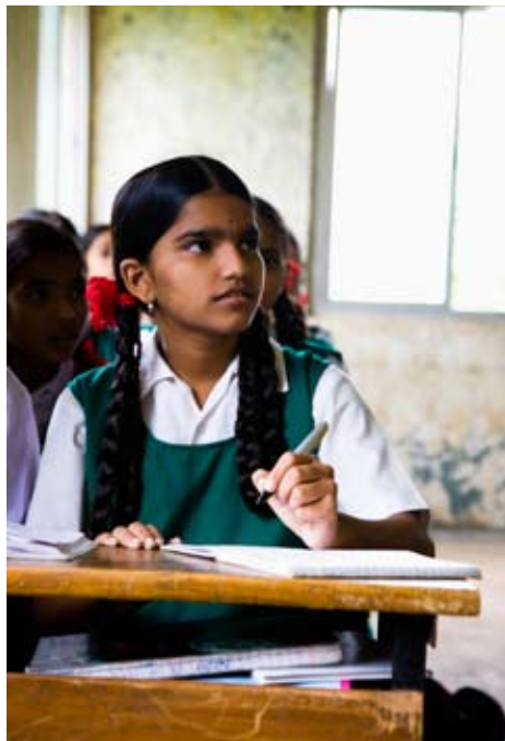
Educating girls is believed to lead to population stability and less social unrest.

The Harvard University psychologist Steven Pinker identifies several other possible reasons for the recent decline of warfare and other forms of violence. First, the creation of stable states with effective legal systems and