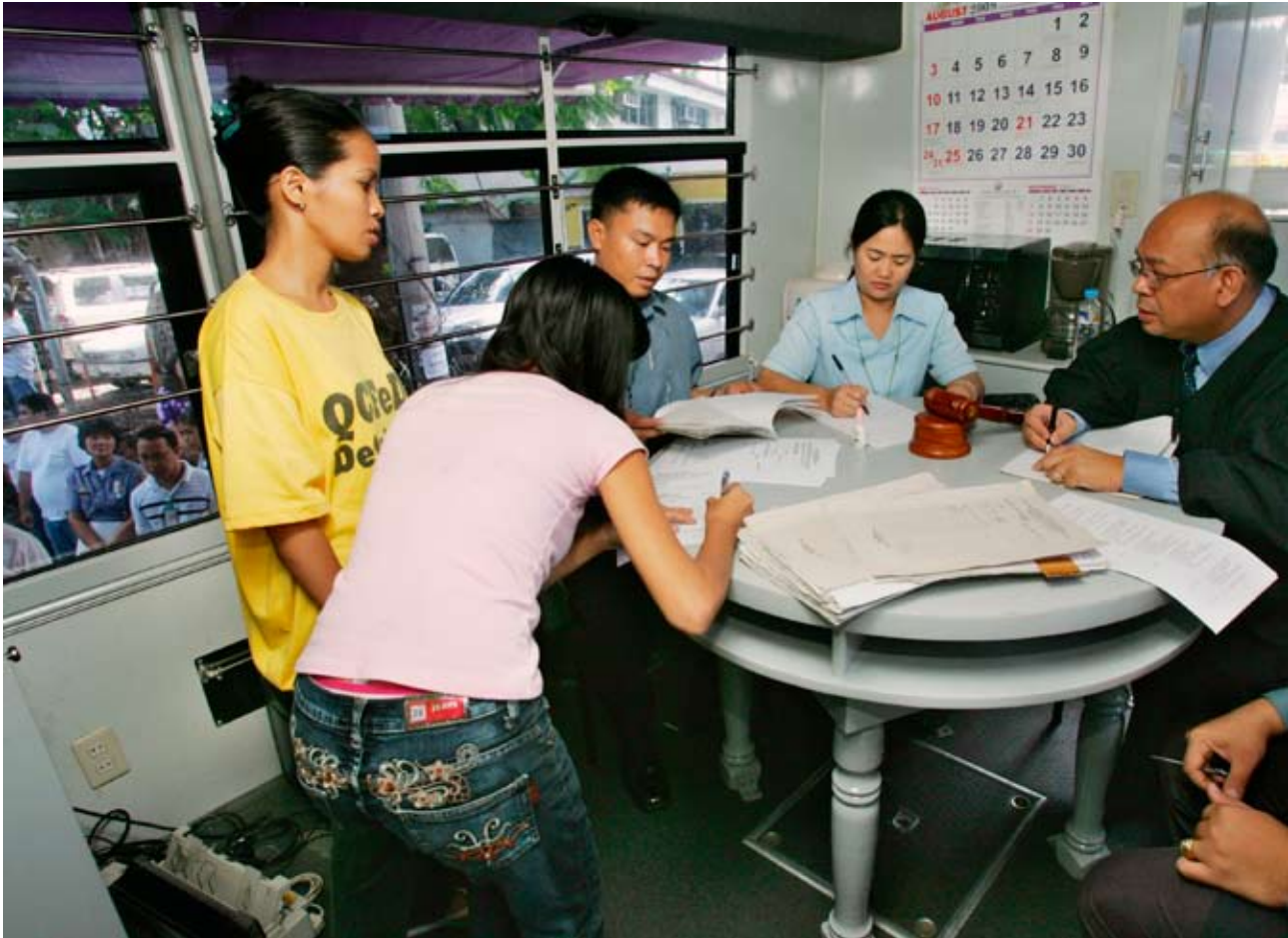
Legal institutions, such as this mobile court in the Philippines, have reduced the risk of violence.

in Africa have observed male chimpanzees from the same troop banding together to patrol their territory; if they encounter a chimp from a different troop, the raiders beat him, often to death.