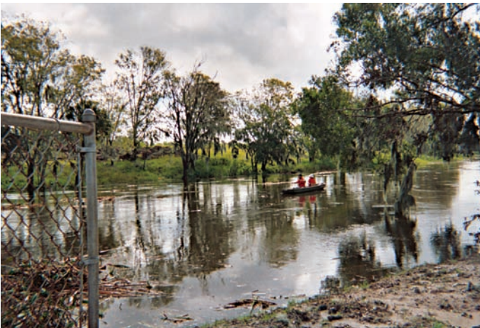
Figure 2. Views of Saddle Creek below Structure P-11 (site 5) near Bartow looking downstream. Top—view when creek was at 0.02 \text{ft}^3/\text{s} on December 1, 2003. Bottom—view of boat measurement at discharge of 1,550 \text{ft}^3/\text{s} on September 13, 2004.