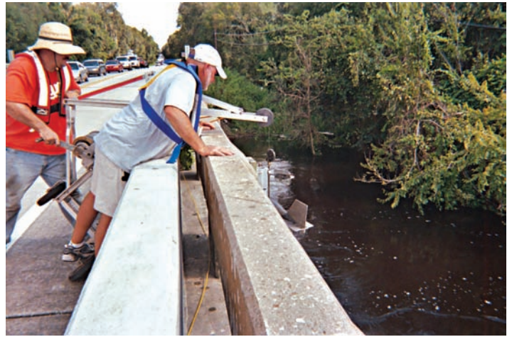
Figure 3. U.S. Geological Survey field crew making flow measurement at Alafia River at Lithia (site 15) using current meter, bridge crane, and 100-pound weight at discharge of 10,000 cubic feet per second at gage height 21.86 feet on September 8, 2004.

The flooding caused by widespread rainfall and runoff as a result of Hurricane Frances was most severe in the Peace River Basin. Peak discharges for the period of record were recorded at several gaging stations in the upper Peace River Basin (sites 1-9, fig. 1, table 1; Tiger Creek near Babson Park, Peace Creek Drainage Canal near Wahneta, Saddle Creek at State Highway 542 near Lakeland, Lake Parker Outlet at Lakeland, Saddle Creek at Structure P-11 near Bartow, Peace River at Bartow, Peace River at Ft. Meade, Bowlegs Creek near Ft. Meade, and Payne Creek near Bowling Green). At Peace River at Bartow (site 6), the recurrence interval for the discharge of 4,710 cubic feet per second ( \text{ft}^3/\text{s} ) was determined to be greater than 100 years (Kathleen Hammett, U.S. Geological Survey, written commun., 2004). At the Saddle Creek at Structure P-11 near Bartow station (site 5), USGS field crews measured 1,550 \text{ft}^3/\text{s} of discharge 2 days after the peak flow. This measurement was used to refine the rating curve that determined the peak flow to be 1,640 \text{ft}^3/\text{s} . The gage height at this site was observed to be approximately 9 feet (ft) higher than base flow conditions (fig. 2). The flooding continued downstream to Peace River at Zolfo Springs (site 10) where the discharge of 8,470 \text{ft}^3/\text{s} was computed. This discharge was the