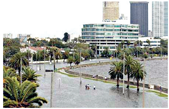
Figure 5. View of flooding in downtown Tampa on September 6, 2004, from storm surge and flooding near the mouth of the Hillsborough River.

was recorded (site 26). A peak discharge of 1,820 ft 3 /s was computed at Cypress Creek near Sulphur Springs (site 27), which was the highest since 1960 and second highest for the period of record. A period of record discharge of 205 ft 3 /s also occurred at Curiosity Creek at 122nd Avenue near Sulphur Springs (site 28). Downtown Tampa also experienced flooding from the Hillsborough River and storm surge from Tampa Bay (fig. 5). The Hillsborough River at Platt Street (site 29) near the mouth of Hillsborough River at Tampa Bay experienced a storm surge nearly 4 ft above the normal high tide gage reading of 11.94 ft. The peak recorded gage height of 15.83 ft was the highest for the period of record (fig. 6).