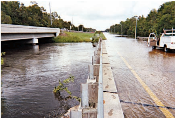
Figure 4. Views of Trout Creek near Sulphur Springs (site 24) on downstream side of bridge. Top—view when creek was at gage height of 37.01 ft and flow of 25 ft 3 /s on October 2, 2003. Middle—view during flood on September 7, 2004, at stage 6 ft higher and flow of 1,610 ft 3 /s. Bottom—view of west bound traffic lane (State Highway 581) overflow discharge on September 7, 2004.

was recorded (site 26). A peak discharge of 1,820 ft 3 /s was computed at Cypress Creek near Sulphur Springs (site 27), which was the highest since 1960 and second highest for the period of record. A period of record discharge of 205 ft 3 /s also occurred at Curiosity Creek at 122nd Avenue near Sulphur Springs (site 28). Downtown Tampa also experienced flooding from the Hillsborough River and storm surge from Tampa Bay (fig. 5). The Hillsborough River at Platt Street (site 29) near the mouth of Hillsborough River at Tampa Bay experienced a storm surge nearly 4 ft above the normal high tide gage reading of 11.94 ft. The peak recorded gage height of 15.83 ft was the highest for the period of record (fig. 6).