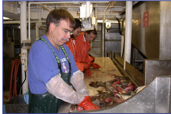
Sorting fish collected during a groundfish survey

The Center leads the West Coast Groundfish Observer Program. As part of this program, observers are placed on commercial fishing vessels to monitor and record groundfish catch data and collect critical biological data. In January, the Program released a summary and analysis of its first year of trawl fleet observations. This is the first comprehensive coast-wide information on bycatch and discard for West Coast groundfish.