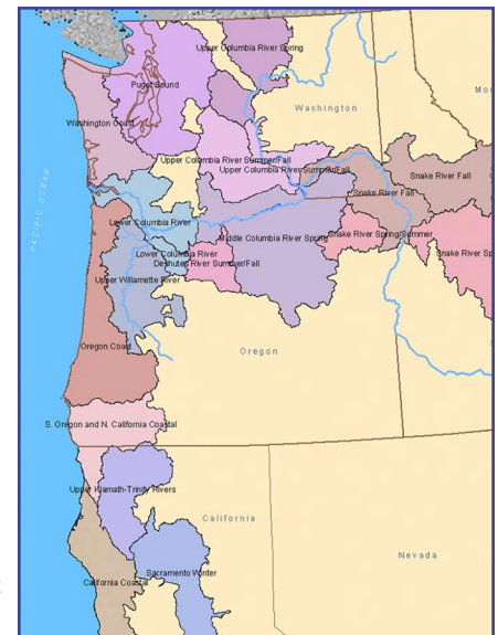
26 listed West Coast salmon and steelhead ESUs

On the West Coast, 26 salmon and steelhead populations or evolutionarily significant units (ESUs) are currently listed as endangered or threatened under the Endangered Species Act (ESA). Center scientists, in conjunction with Southwest Center scientists, updated the status reviews of all 26 currently listed salmon and steelhead ESUs, as well as one candidate species population. In their assessments, scientists considered new data that had accumulated since the last reviews in the mid-to-late 1990s and addressed issues raised in recent court cases regarding the consideration of hatchery fish and resident fish populations in listing determinations. This was a huge undertaking. Scientists compiled and updated abundance, productivity, diversity, and spatial structure data for each ESU. The analyses and resulting report will provide the scientific basis NOAA Fisheries needs to recommend any changes to the ESA listing status of West Coast salmon and steelhead populations.