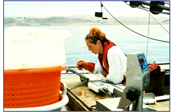
Entering data with the new on-board data collection system

The Center implemented a new on-board data collection system that relies on a small wireless network. This network connects a "ruggedized" touchscreen computer to electronic measuring equipment for outdoor data collection. Additionally, the system connects to an indoor network to maintain continuity with trawl operations and to provide data back-up and follow-on processing. This system has improved the data collection process.