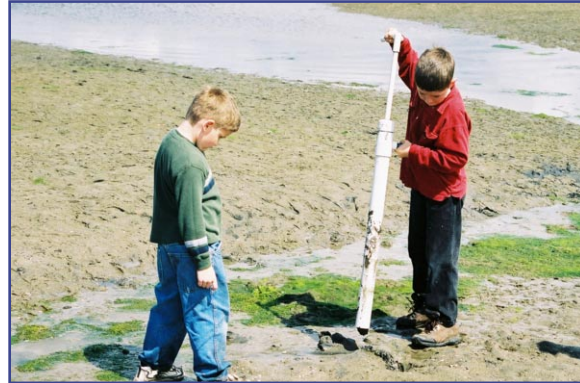
Children participating in a SeaFest activity

The Center signed an agreement with Washington State University to support cooperative research opportunities that will advance salmon recovery efforts in the interior Columbia River Basin. The Center also partnered with the Pacific States Marine Fisheries Commission, Pacific Fishery Management Council, and the Pacific Marine Conservation Council to create a new cooperative research website.