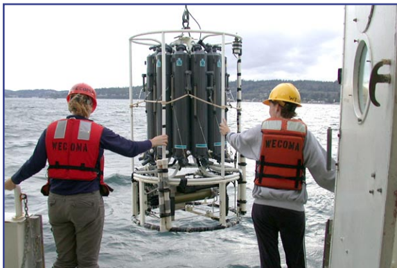
Deploying a CTD during a research cruise

Living marine resources in the Pacific Northwest use and depend on a variety of ecosystems from freshwater streams and rivers to estuaries and the ocean. Center scientists conduct research to better understand how natural environmental fluctuations impact living marine resource productivity, how human-caused stress affects ecosystems and living marine resources, and the complex interactions between living marine resources and their habitats.