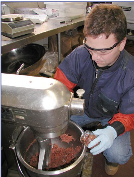
Preparing killer whale prey samples for contaminant & nutrition analysis