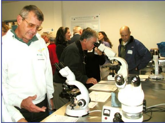
Attendees visiting science stations at the Center's Captain R. Barry Fisher building

Sharing our work with other scientists, with policymakers, and with the public is important to us. To learn more about what we do, please visit our website at www.nwfsc.noaa.gov . To arrange a visit or obtain additional information, please call 206-860-3200.