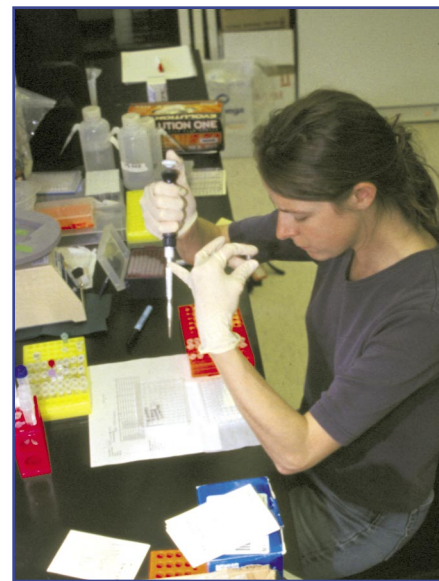
Preparing samples for DNA analysis

Hatcheries have the potential to assist in the conservation of wild stocks, but they also pose some risks. At this time, scientists still have many questions about the extent to which hatchery programs enhance or threaten the survival of wild populations. To accurately determine the viability of wild salmon populations, it is critical to understand the fitness of hatchery fish. Center scientists, in collaboration with state and tribal scientists, used DNA "fingerprinting" methods on thousands of adult and juvenile salmon to track the success or failure of individual hatchery and wild fish.