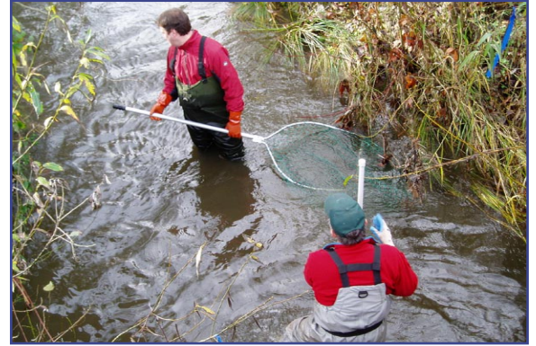
Surveying a Washington urban stream

For several years, local agencies have provided anecdotal reports of prespawn mortality of adult coho salmon in Puget Sound urban streams. If salmon die before they spawn, they do not contribute to the next generation—a potentially serious issue for endangered and threatened populations. To further investigate this issue, the Center, in collaboration with local agencies, conducted a series of studies in fall/winter 2002. Through weeks of intense fieldwork, scientists documented a very high rate of acute mortality (>90%) in adult coho salmon returning to spawn in urban streams. Before they died, these adult coho showed a common suite of symptoms (e.g., loss of orientation and equilibrium). Although we do not know the cause of this mortality, poor water quality is a leading hypothesis. Expanded field surveys in fall/winter 2003 will further investigate the cause(s) of this mortality.