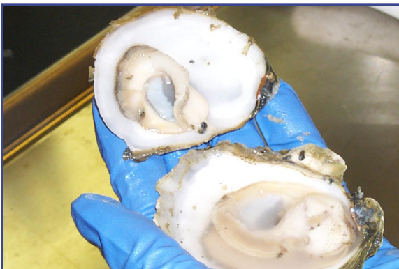
Analyzing oysters for presence of experimentally introduced Vibrio vulnificus

Captive broodstock programs play an important role in species conservation for seriously depleted populations, such as Redfish Lake sockeye salmon. These programs are challenging, however, because the salmon that are produced must be healthy and capable of surviving and reproducing in the wild. Center scientists, in collaboration with the University of Maryland, advanced spawning time of Redfish Lake sockeye salmon captive broodstock with implants of gonadotropin-releasing hormone, a drug commonly used to treat infertility in humans. The hormone has improved survival of offspring and will significantly improve the production of juvenile fish from captive broodstock programs for recovery of depleted Pacific salmon stocks.