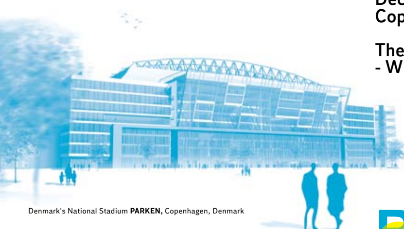
Denmark's National Stadium PARKEN , Copenhagen, Denmark

The entire world will be watching! - Will they see you?