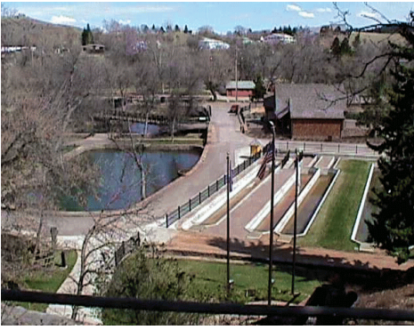
DC Booth Historic National Fish Hatchery; USFWS

Some of the many exciting recreational, cultural, and educational opportunities are: