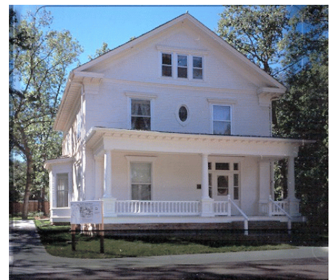
Historic 1905 Superintendent's Residence

With over 145,000 visitors annually, the dedicated staff and volunteer hosts at the Visitor Center and Museum bring the hatchery experience alive with educational hatchery and museum tours and exhibits. Educational programs/tours are provided for the public and school groups during business hours.