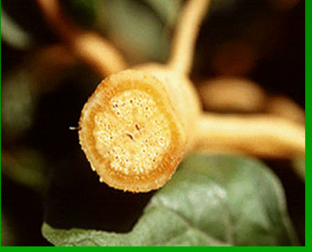
Pumpkin vine cross section Yellow vine disease

Pumpkin patch affected by yellow vine disease, 1992