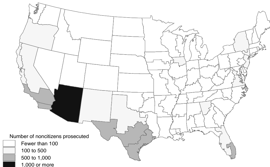
Noncitizens prosecuted in U.S. district courts, 1994

Note: Alaska, Hawaii, the Commonwealth of Puerto Rico, and the U.S. territories are not depicted.