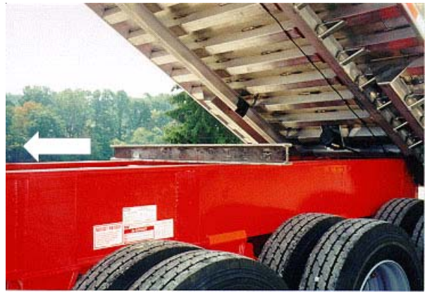
Figure 3. Shows a steel I-beam makeshift body prop: steel I-beam sits across truck frame. The I-beam is not attached to the truck frame or dump body. The I-beam could be displaced in the direction of the arrow by the inadvertent movement of the dump body or truck frame.