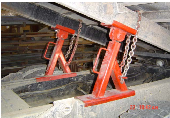
Figure 5. Engineered truck bed brace brackets.

The following is an example of the prototype truck bed brace brackets (see Figures 5, 6 and 7) that were developed by the employer and can be used universally on any brand of dump box. The standard flange is 3.5 inches and the braces will fit up to a 4.5 inch channel. In addition, these braces have a handle that allows the employee to place the brace under the dump box without creating an additional hazard. The employee must rest the brace on the frame of the truck while standing next to the tires.