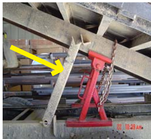
Figure 4. Positive supports are provided by dump bed manufacturers in the form of body props. Body props are non-adjustable and will support the dump body at one position only.

Strong, heavy, positive supports are provided by dump bed manufacturers in the form of body props. Body props are non-adjustable and will support the dump body at only one position that is close to the maximum elevated dump angle. Therefore, the need to inspect and/or work on the dump bed at an angle other than the one provided by the body prop will require additional or alternative protection.