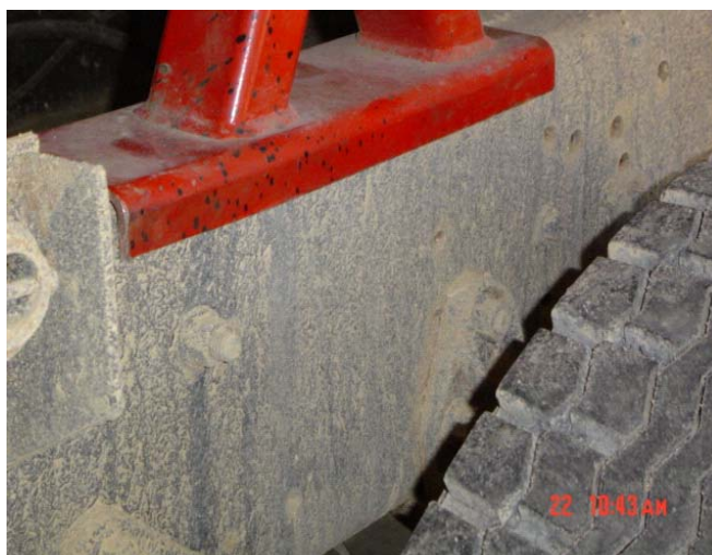
Figure 6. Truck bed brace bracket (bottom channel).