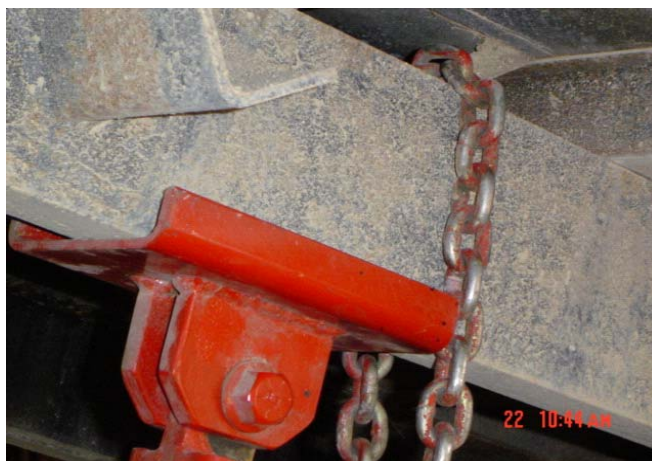
Figure 7. Truck bed brace bracket (top channel supporting dump body.)