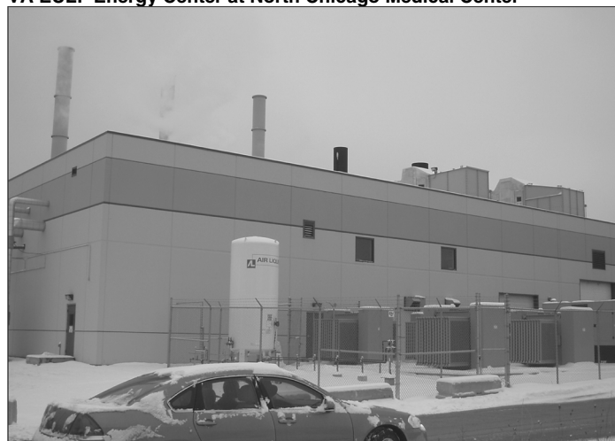
VA EUL: Energy Center at North Chicago Medical Center

In addition to its EUL authority, VA may sell unneeded real property and retain the proceeds under its Capital Asset Fund (CAF) authority. However, VA sold no properties using this authority. According to VA officials, the agency places greater emphasis on entering into EULs, compared to real property sales, in part because VA can enter into EULs with fewer restrictions than under its CAF authority. For example, VA may enter into EULs without having to screen the property for homeless use, while property must be screened for homeless use if VA is selling property under its CAF authority. In addition, while VA has the authority to retain and spend proceeds from EULs without the need for further congressional action, proceeds retained under CAF authority are subject to further congressional action.