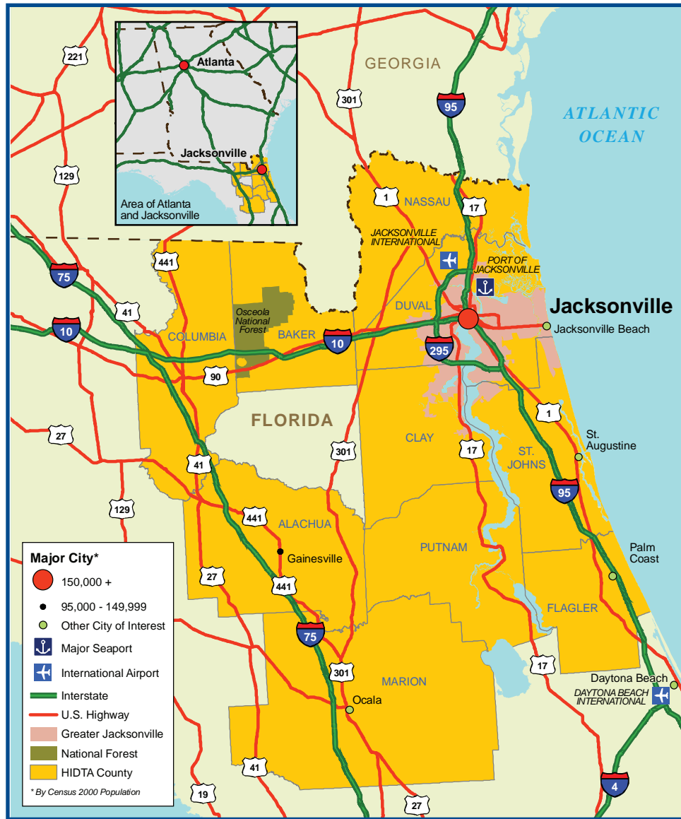
Figure 2. North Florida HIDTA transportation infrastructure.

means. Traffickers often use independently owned commercial trucks and private or rental vehicles to transport multihundred-kilogram quantities of powder cocaine and marijuana, which they commingle in shipments of legitimate goods or conceal in hidden compartments. Moreover, some traffickers are attempting to avoid law enforcement interdiction efforts along major interstates in the region by using more indirect routes, such as state roads, to transport drugs into and through the HIDTA region.