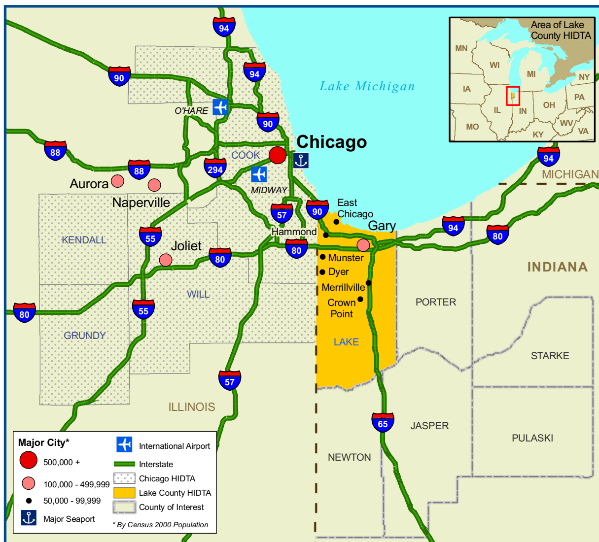
Figure 1. Lake County High Intensity Drug Trafficking Area.

This assessment provides a strategic overview of the illicit drug situation in the Lake County High Intensity Drug Trafficking Area (HIDTA), highlighting significant trends and law enforcement concerns related to the trafficking and abuse of illicit drugs. The report was prepared through detailed analysis of recent law enforcement reporting, information obtained through interviews with law enforcement and public health officials, and available statistical data. The report is designed to provide policymakers, resource planners, and law enforcement officials with a focused discussion of key drug issues and developments facing the Lake County HIDTA.