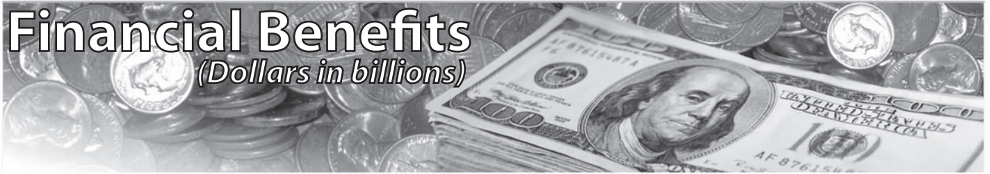
Figure 2: GAO's Selected Major Financial Benefits Reported in Fiscal Year 2006