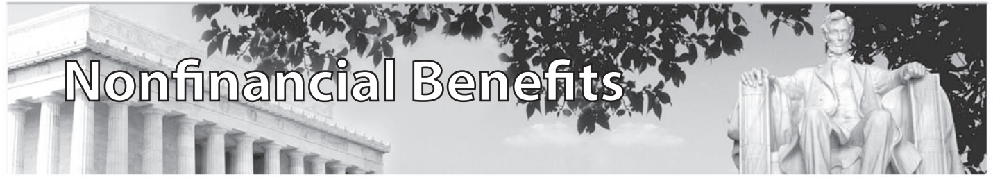
Figure 3: GAO's Selected Nonfinancial Benefits Reported in Fiscal Year 2006