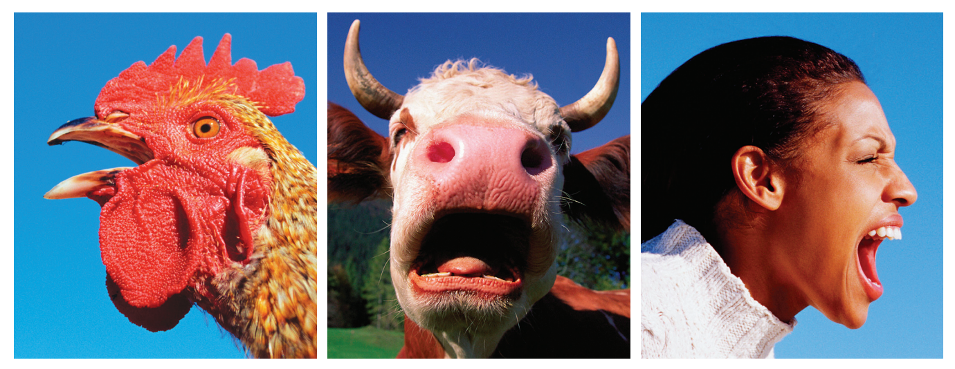
Everybody's got one. The ability of innate immunity to block pathogens at the mucous membranes appears highly conserved across species.

A major breakthrough came when researchers in the laboratory of FPMI co-leader