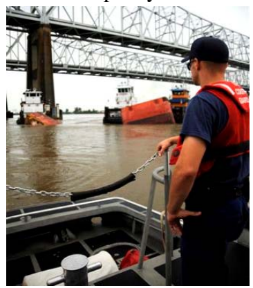
Broken & sinking barge on the Mississippi River after a collision.

In 2007, I introduced the Coast Guard's Marine Safety Improvement Plan, which was followed shortly thereafter by the Marine Safety Performance Plan. Expanding the Coast Guard's capacity and continuing to develop the expertise of our marine safety workforce is