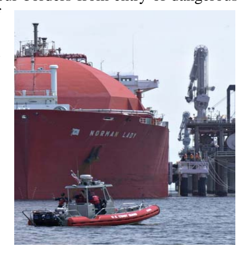
LNG Tanker security zone enforced by Coast Guard small boat.

materials and people, we must also consider the security of legitimate commerce in the maritime domain. This is particularly important when considering the health and safety risks vessels carrying Certain Dangerous Cargoes (CDCs) such as Liquefied Natural Gas (LNG), chlorine, anhydrous ammonia and various petroleum products present in our ports, waterways and adjacent population centers. The expansion of LNG facilities and corresponding increase in waterborne LNG shipments to meet our nation's energy demands is well known. However, LNG is just one of many CDCs transported through the MTS that must be considered in a national dialogue on cargo and energy infrastructure security.