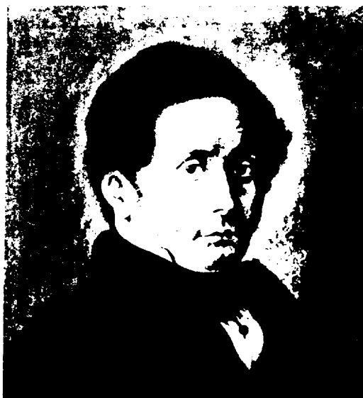
Pastel of Pasteur's father.

Pasteur moved from his studies of optical rotation to fermentation, where, in opposition to the commonly accepted views of the leading German chemist, Justus Liebig, he demonstrated convincingly the role of yeast in alco-