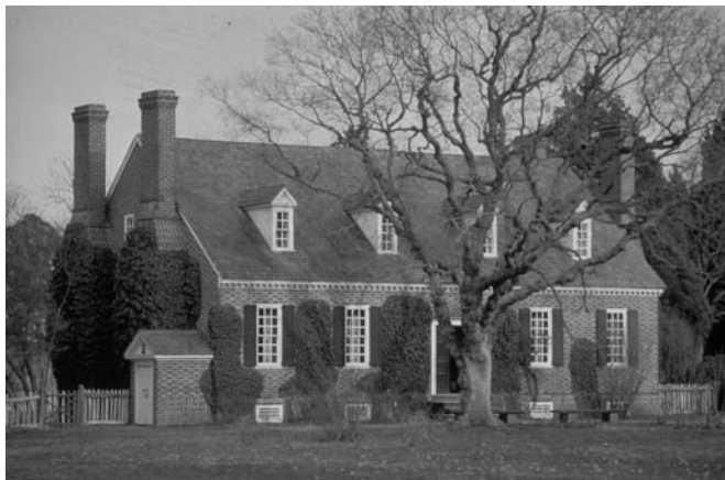
George Washington Birthplace National Monument, Virginia.

Also, the Park Service had become especially interested in acquiring historical parks in the more populous eastern United States. Between 1930 and early 1933, it gained three new parks representing the Colonial era and Revolutionary War: the George Washington Birth-