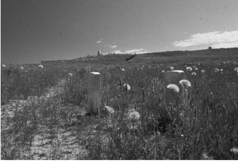
Little Bighorn Battlefield National Monument, Montana.

became the most contested issue of all, but ultimately proponents for both the name change and the Indian memorial prevailed. Surely these high-publicity events and their resolution helped intensify and perpetuate the controversy and celebrity of the battlefield.