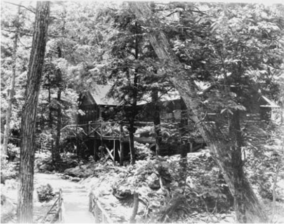
The President's Cabin at Rapidan Camp, ca. early 1930s.