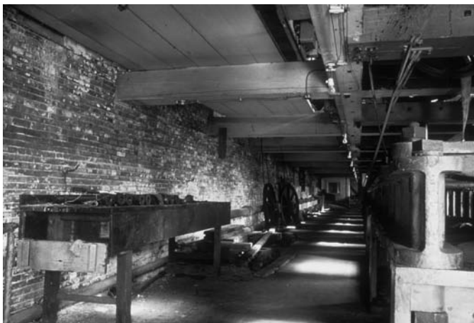
Lowell National Historical Park, Massachusetts.

the Cane River National Heritage Area features Creole and other southern cultures in a rural Louisiana setting, while the Lackawanna Valley area in northeastern Pennsylvania reveals the history and culture of a coal mining and industrial region. Such new kinds of areas involving cultural and social history have helped advance another Park Service trend that has affected most areas of the nation-