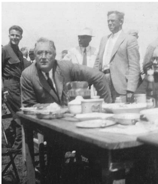
President Franklin D. Roosevelt visiting a CCC camp at Shenandoah, August 1933—about four months after his visit to the park with Horace Albright, described in the text.

By August 1933, the National Park Service had built its public status not on historic preservation, but primarily on its management of a number of large, spectacular national parks mostly in the West. Yellowstone, established in 1872, was the first, followed much later by such majestic parks as Sequoia, Yosemite, and Mount Rainier. These parks gained great renown, becoming geographical symbols of national identity and destination sites for thousands of tourists. The Park Service—much more than its management predecessors in the Department of the Interior—had worked diligently to attract people to the parks and to educate visitors about the areas’ natural history and special scenic features. To enable the public to see and enjoy the parks, the Park Service’s first director, Stephen T. Mather (Albright’s immediate predecessor) aggressively sought to develop roads, trails, camping areas, tour-bus systems, and many other facilities. Under Mather’s guidance, the parks continued to enjoy enthusiastic support from railroad companies, and then from automobile associations, all interested in promoting tourism to these extraordinarily scenic places. 2