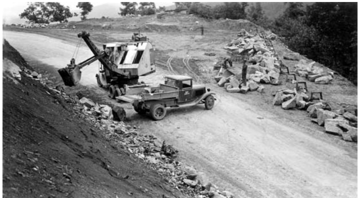
Stone guardrail under construction on Skyline Drive, early 1930s.

The visit with Roosevelt was a rare opportunity for the Park Service director, but one he had prepared for. Even before the National Park Service was established as a bureau of the Department of the Interior in 1916, Albright and key members of Congress had envisioned the Park Service taking control of all federal lands set aside for their historical associations. They planned that the Park Service would be in charge of not only ancient southwestern Indian sites managed by the U.S. Forest Service, but also historic areas under the War Department, which oversaw Civil War battlefield parks and other historic sites, including those in the nation's capital. Sites that Albright had especially wanted included battlefield parks such as Shiloh, Gettysburg, and Vicksburg; plus the Forest Service's archeological areas in the Southwest. But the 1916 act did not turn these places over to the Park Service. And by 1933, Albright was increasingly certain that such places were not being managed satisfactorily enough to fulfill the American public's desire to see them and gain a better understanding of their history and significance. The Park Service itself was convinced that, given the experience it had gained in historic site management by 1933, it could oversee these