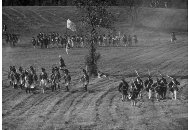
Saratoga National Historical Park, New York.

ably few, if any, such opportunities came about as a result of the kind of enthusiastic spontaneity displayed by Roosevelt on the return from Shenandoah. The Park Service would resist many proposals for new historical parks, declaring them unsuitable; still, it steadily and selectively sought expansion of its historic preservation responsibilities, which would grow significantly over the years.