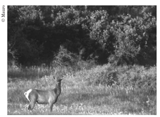
Focus groups considered wildlife management and several other subjects.

Six focus group meetings were held on October 28, 29, and 30, 2002. The purpose of the focus group meetings was to convene a forum to better explore key issues, as well as the potential management alternatives and their implications. Participants were invited because of their