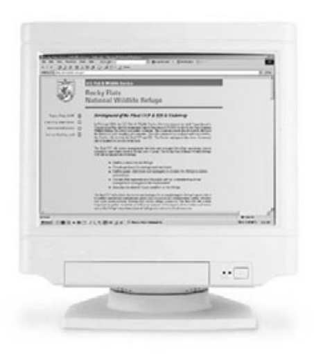
The Rocky Flats CCP website provided important information about the planning process and allowed stakeholders to submit their comments and questions.

Throughout the project additional planning documents and announcements of upcoming events were posted on the website. The website also provided an avenue for submitting questions and comments to the planning team.