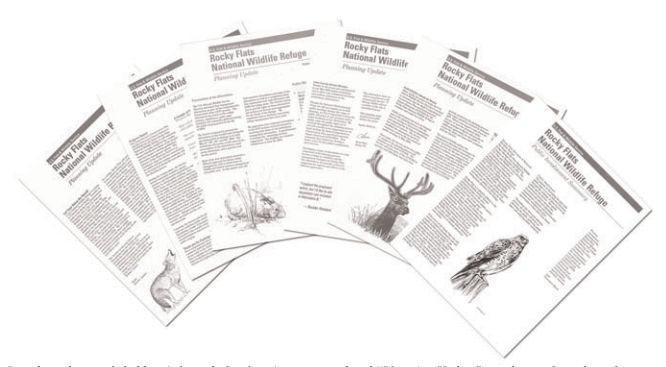
In order to keep stakeholders informed, the planning team produced "Planning Update" newsletters throughout the course of the project.

Several weeks before the public scoping meetings, Planning Update #1, an announcement of the scoping meetings, was mailed to 889 individuals, businesses and organizations. The mailing list consisted of individuals and organizations that had previously expressed an interest in Rocky Flats-related issues and were on the Rocky Flats Citizen Advisory Board (RFCAB), the DOE, or Kaiser-Hill (DOE contractor) mailing lists.