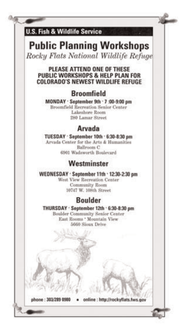
To solicit public input, the Service conducted workshops in the communities surrounding Rocky Flats.

Public scoping meetings were held in September 2002 in Broomfield, Arvada, Westminster, and Boulder. The scoping meetings provided a forum for community residents, public agency members, and interested organizations to express their concerns. To ensure that people's concerns were captured and that they felt comfortable giving verbal comments, participants were allowed to form small groups - each facilitated by a planning team member.