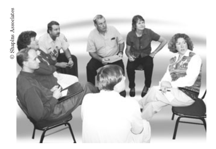
The Service sought input from the public throughout the planning process.

The CCP and EIS were revised and finalized based on analysis of public comments. At this time, the CCP and EIS were divided and published as separate documents. A Notice of Availability (NOA) of the Final EIS and CCP was published in the Federal Register December 2004. In accordance with NEPA, the Service's regional director issued a record of decision (ROD) on the CCP 30 days after the notice in the Federal Register was published. The ROD disclosed the alternative selected by the regional director and the reasons for its selection. The final CCP was then released in April 2005. The final CCP or a summary of the document was made available to interested parties.