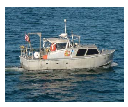
One of the ship's survey launches conducts survey operations.